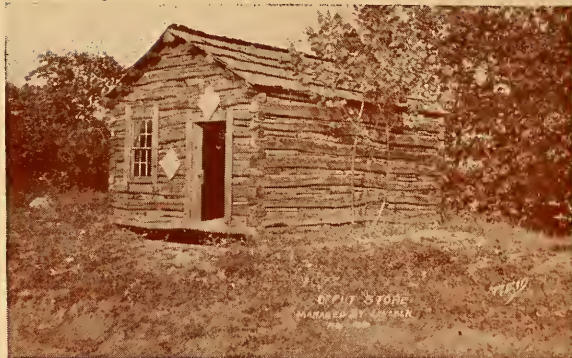
OFFUT STORE Managed by Lincoln 1831-1832