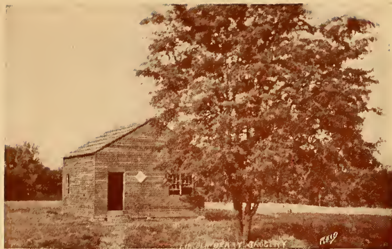
THE LINCOLN-BERRY GROCERY of which the former was part owner