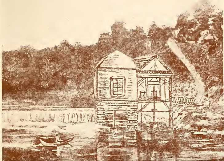
THE OLD MILL AT NEW SALEM

at Gettysburg, in the hospitals and even in the White House itself.