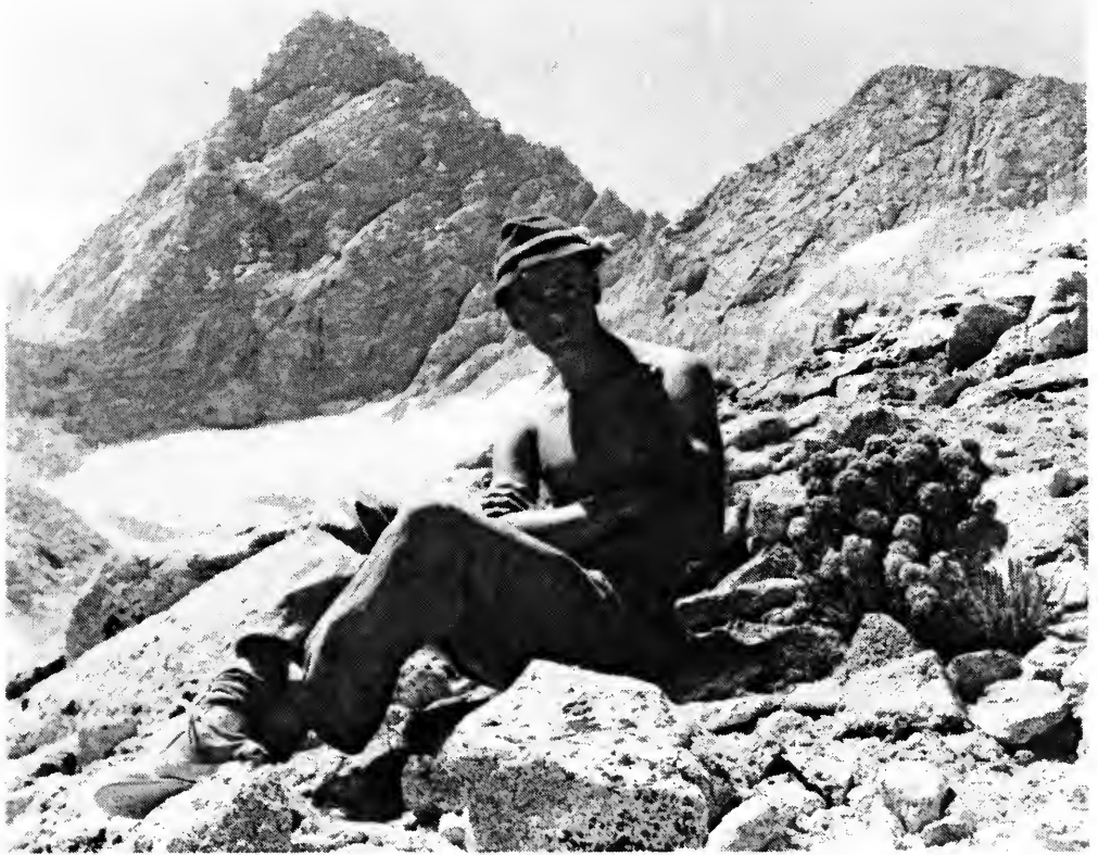
Sierra Club High Trip, mid 1950s