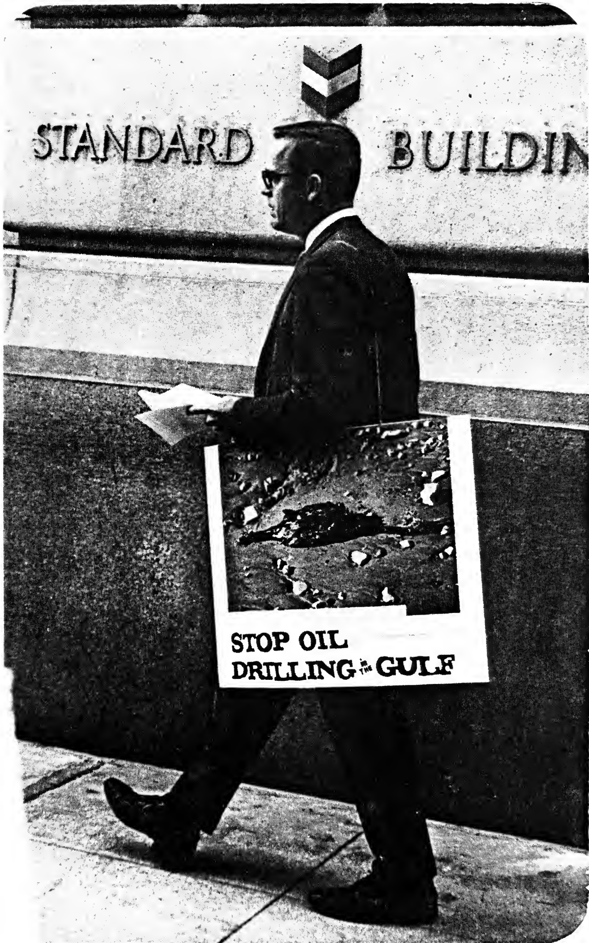
Picketing Standard Oil as Sierra Club President, 1970