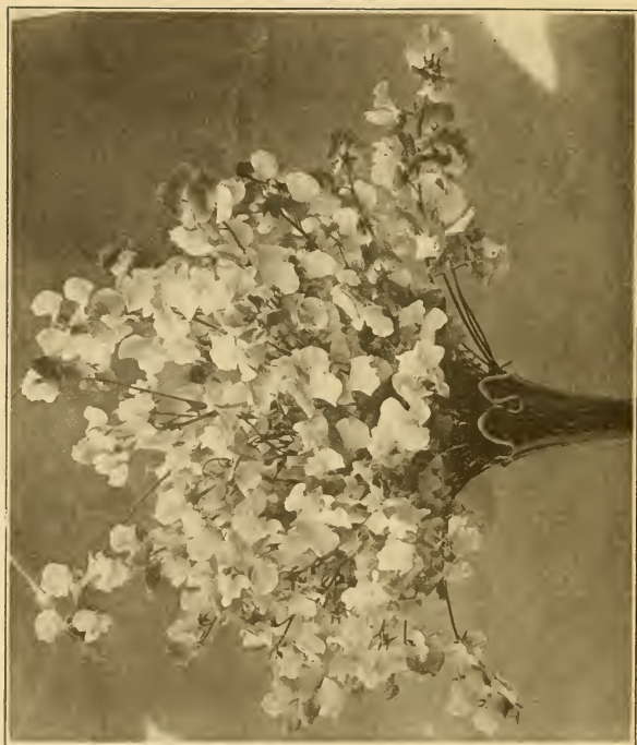
Vase of Columbia.