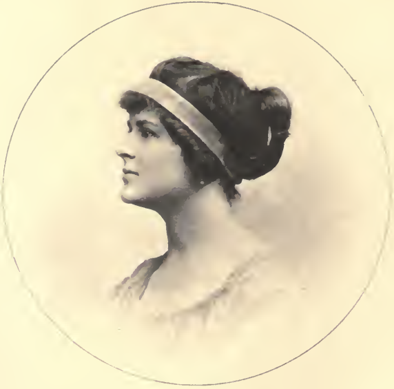
Taken on her Last Leave, 1918.