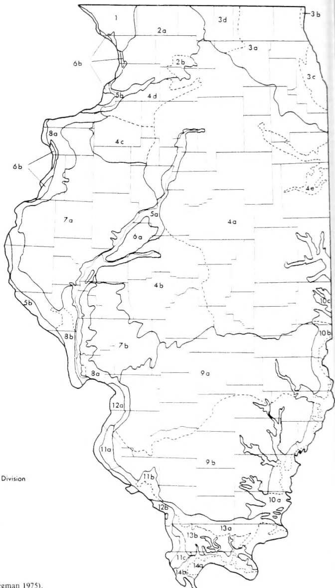
Fig. 2 — Natural divisions of Illinois (Schwegman 1975).