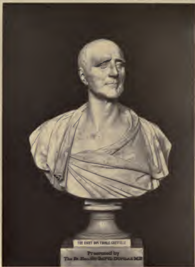
FROM THE ROOM OF THE GREVILLE LIBRARY, BRITISH MUSEUM.