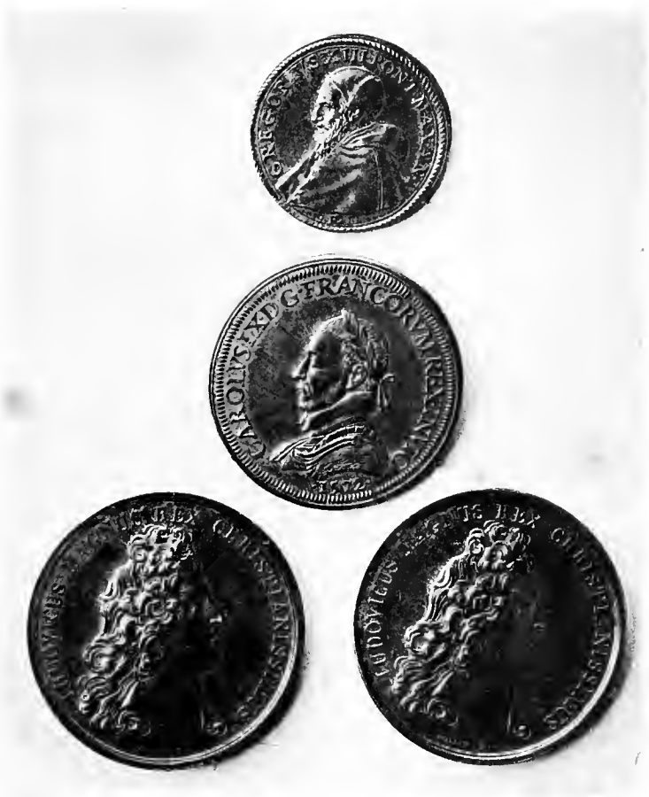
HUGUENOT MEDALS. OBTVERSE SIDE.