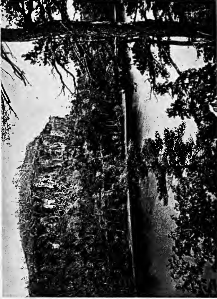
PALTZ ROCK, AND LAKE MOHONK.