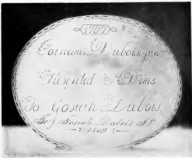
ARMORIAL SILVER BOX. LOWER SIDE.