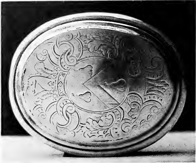
ARMORIAL SILVER BOX (TOP.)