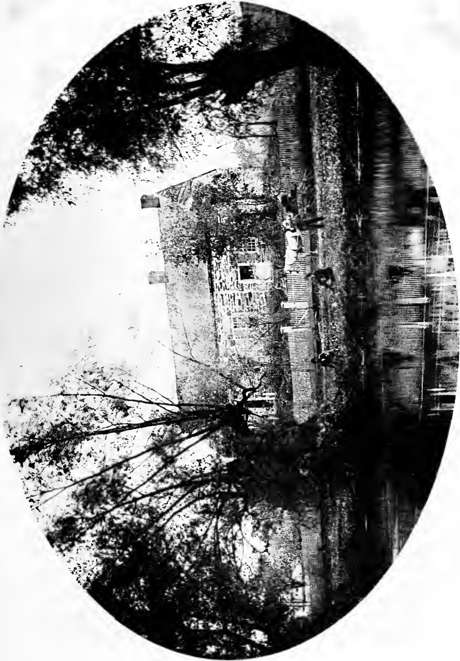
OLD DU BOIS HOUSE, CATSKILL.