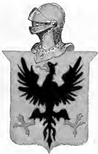
ORIGINAL DU BOIS ARMS.

Arms "d'or, à l'aigle eployé de sable onglé, becqué de gueles."