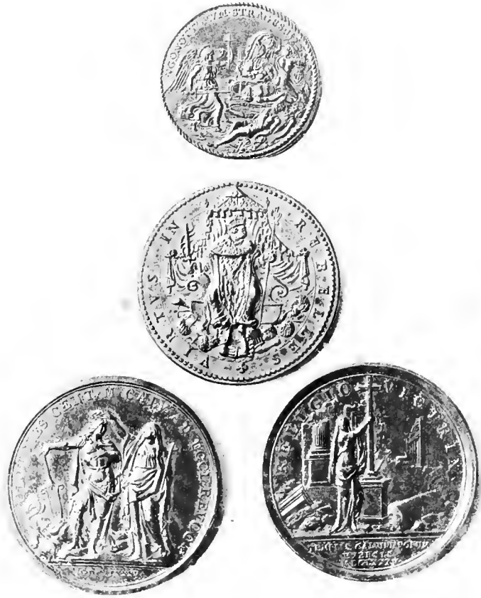
HUGUENOT MEDALS. REVERSE SIDE.