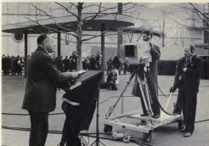
DEDICATION OF RCA BUILDING AT WORLD'S FAIR

Educational Counsellor of NBC. Former President of Yale University.