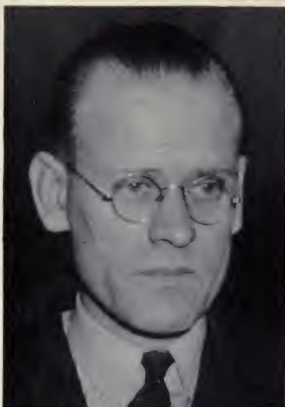
PHILO T. FARNSWORTH

Inventor of the Iconoscope and other epoch-marking television devices.