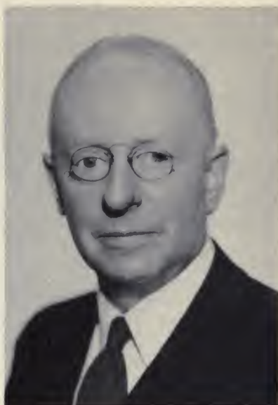
DR. JAMES ROWLAND ANGELL

Educational Director of NBC since 1931. With Aeolian Company, 1922 to 1931.