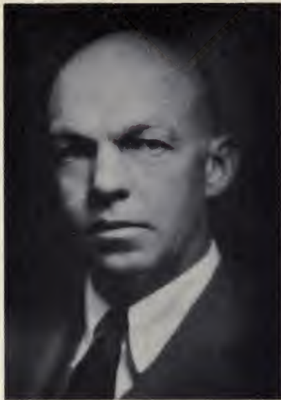
EDWIN H. ARMSTRONG

General Manager of the Mutual Network. An NBC veteran.