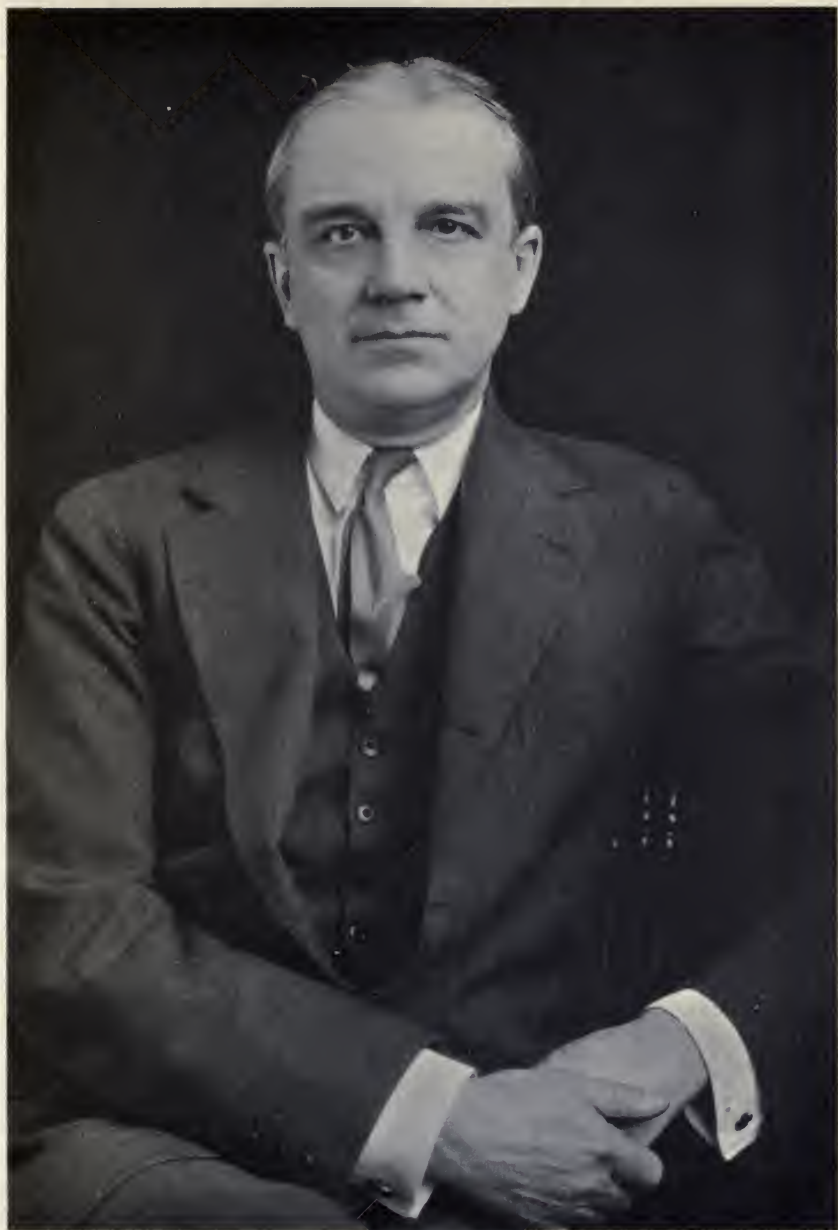
OWEN D. YOUNG

Commander-in-chief of the Radio Group. International figure in World War reconstruction.