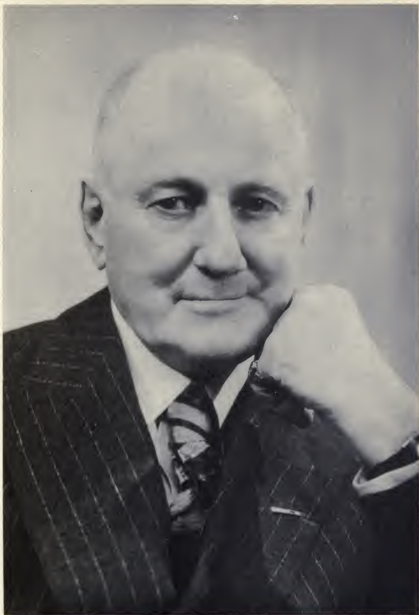
GENERAL JAMES G. HARBORD

Distinguished World War commander. Second President of RCA. Since 1930 Chairman of Board of RCA.