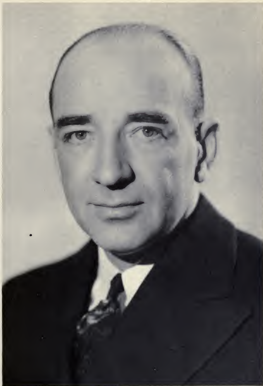
MAJOR LENOX R. LOHR

President NBC since January 1, 1936. World War veteran; General Manager "Century of Progress Exposition," Chicago 1933-1934.