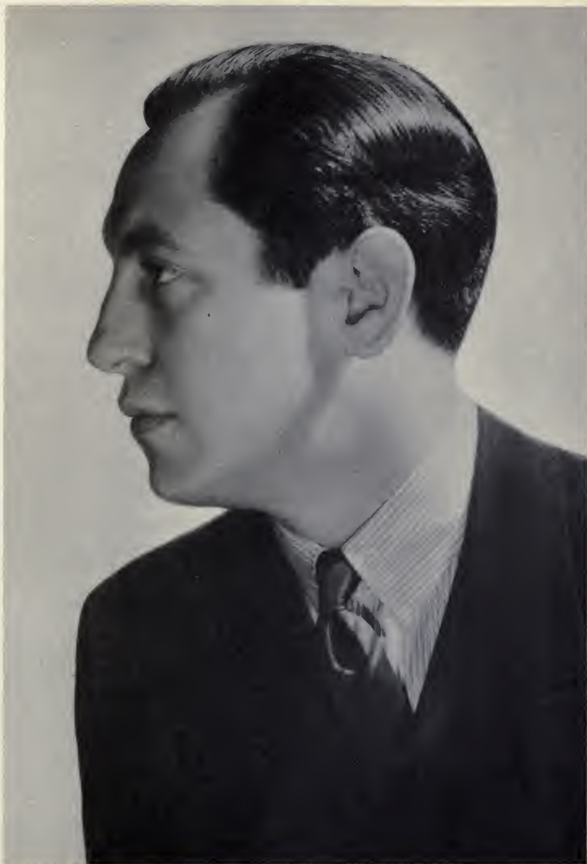
WILLIAM S. PALEY

President of Columbia Broadcasting System, under whose dynamic leadership the company has made radio history.