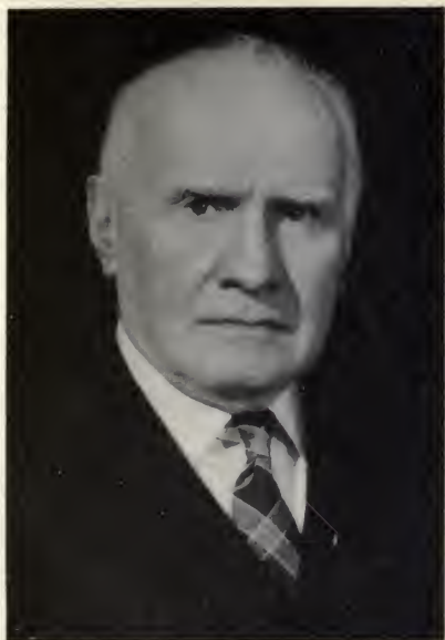
DR. WALTER J. DAMROSCH His Music Appreciation Hour has been a radio feature for more than a decade.