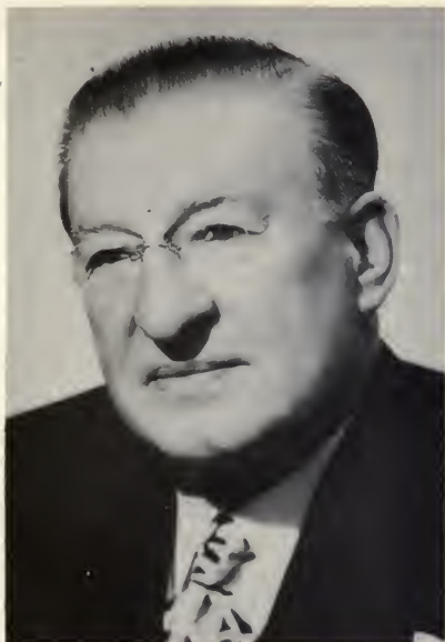
MAJOR EDWARD BOWES

A great radio personality who has retained his popularity since July, 1925.