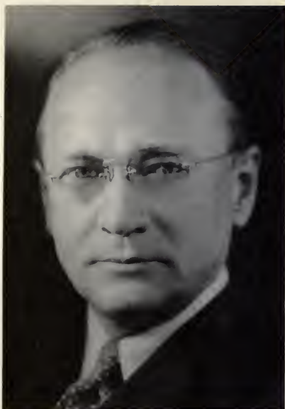
VLADIMIR K. ZWORYKIN

Inventor of the Iconoscope and other epoch-marking television devices.