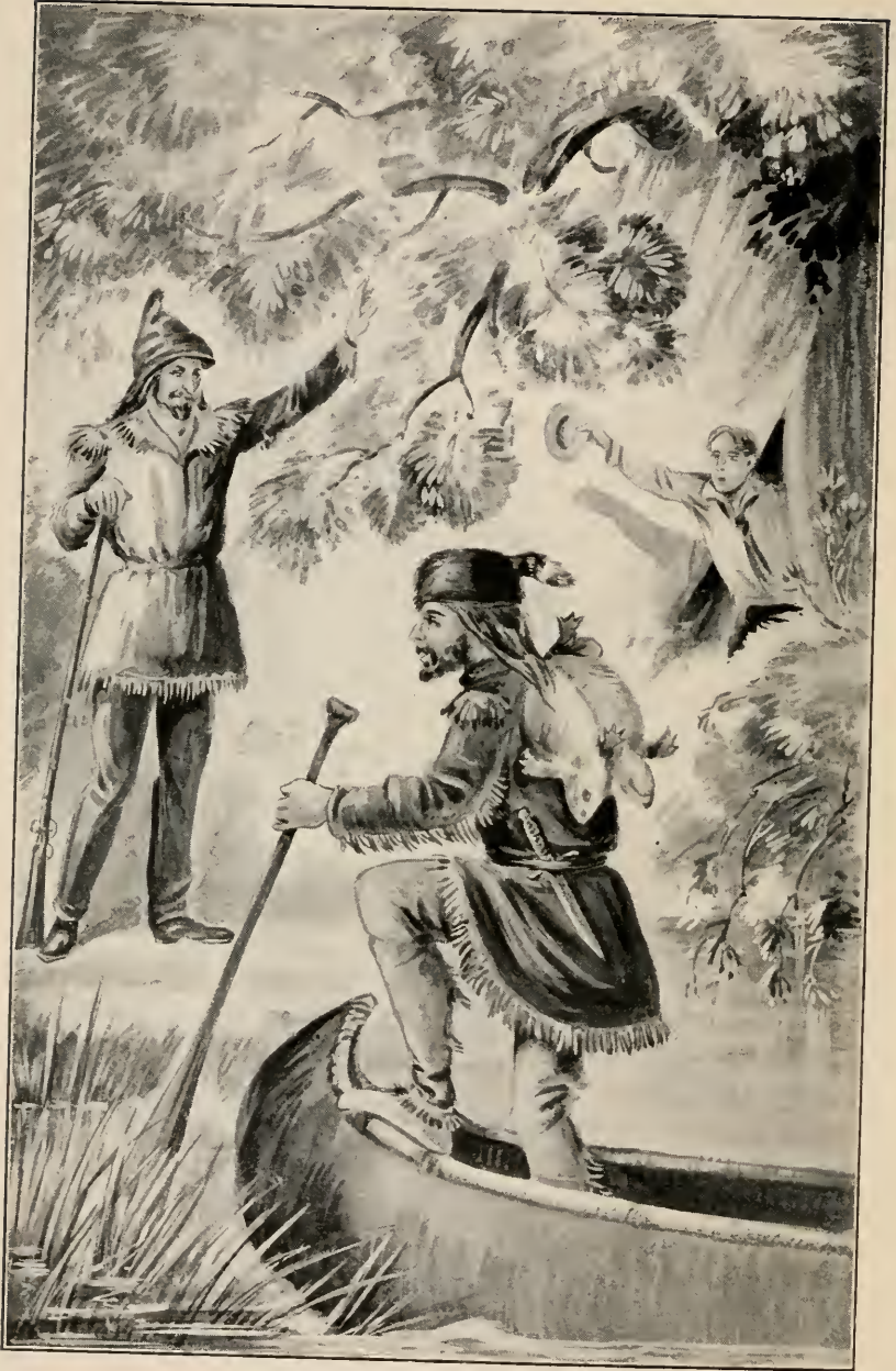
THE TRAPPER'S HOME.