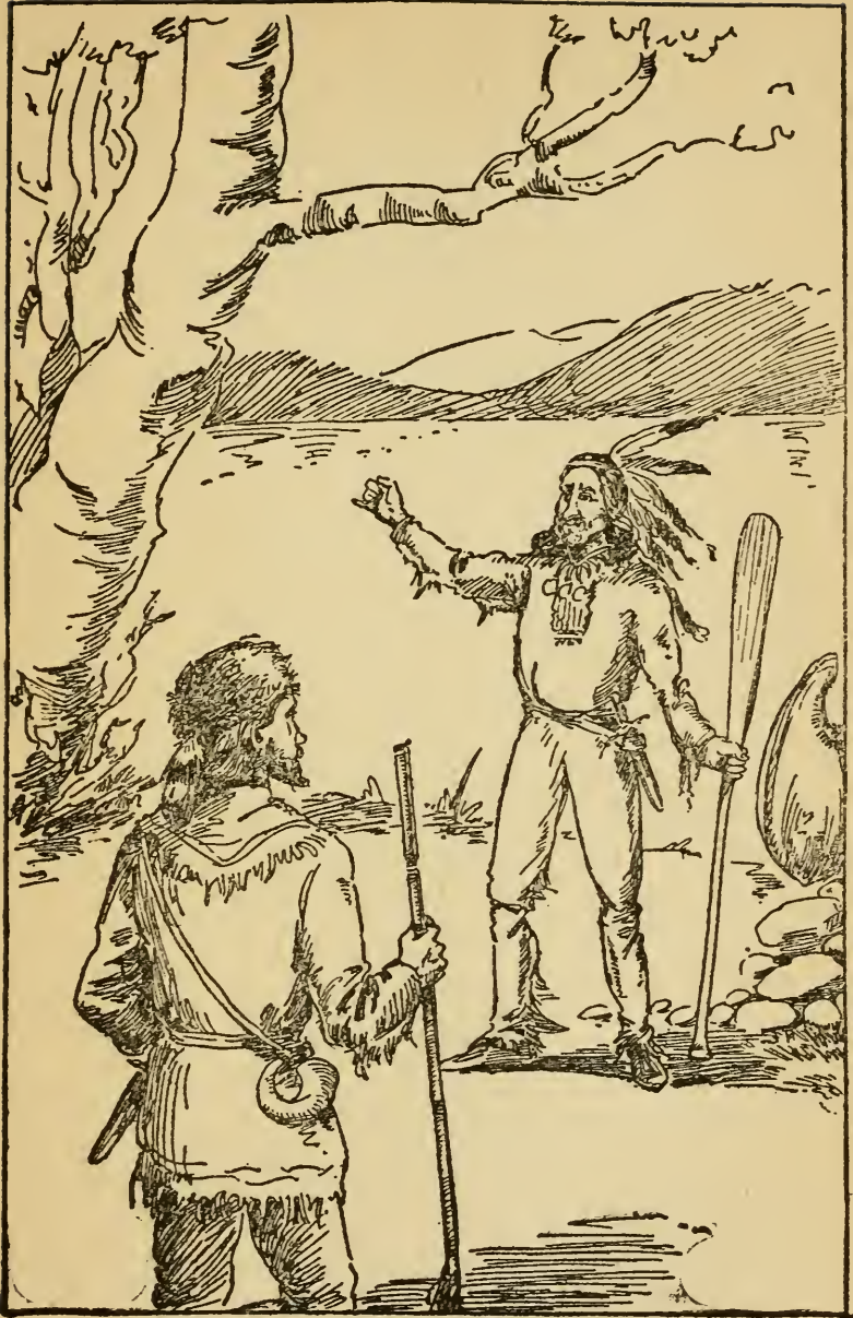
"No less personage than Nat stepped ashore."