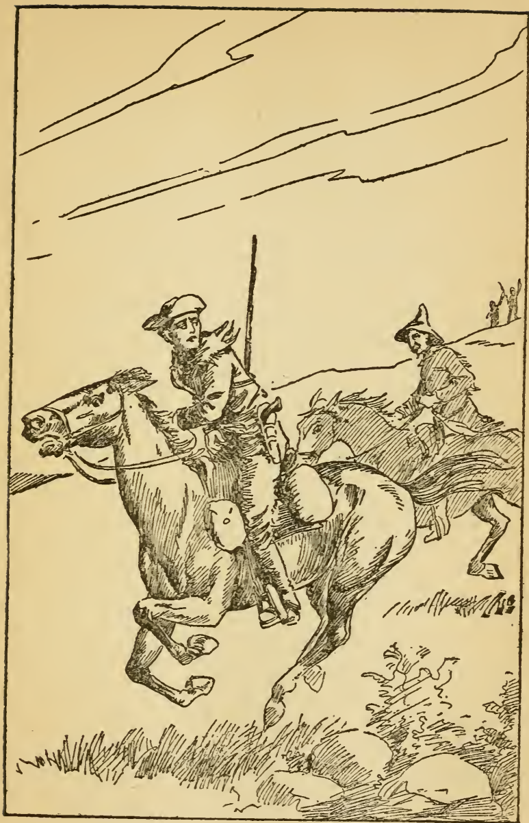
"Looking back saw a host of savage forms."