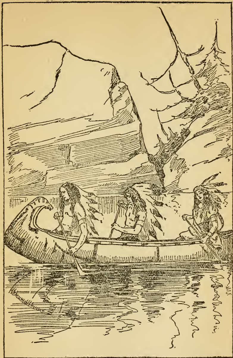
“In the stern, with a guiding oar, sat a young female.”