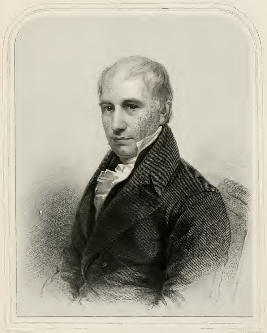
Portrait of [Name], [Title], [Location], [Date]