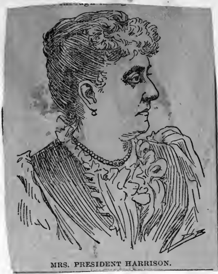
MRS. PRESIDENT HARRISON.

Entered according to Act of Congress, in the year 1876, by GEO. FISHER & CO., in the office of the Librarian of Congress, at Washington.