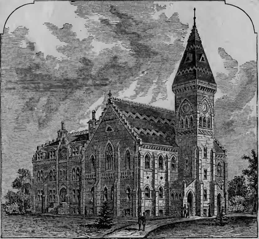
The above is a very accurate cut of the new College Building now in process of erection at Toledo, Iowa. The building is 80x150 feet, and when finished will be one of the best college buildings in Iowa.