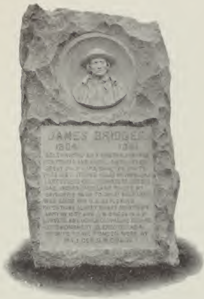
MONUMENT TO JAMES BRIDGER, ERECTED AT MOUNT WASHINGTON CEMETARY, KANSAS CITY, MO. UNVEILED DEC. 11TH, 1904.