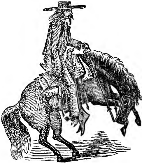
HIS FIRST RIDE.

Cleburne replied, " Doctor, if you don't want to lend me your horse say so, but don't say I