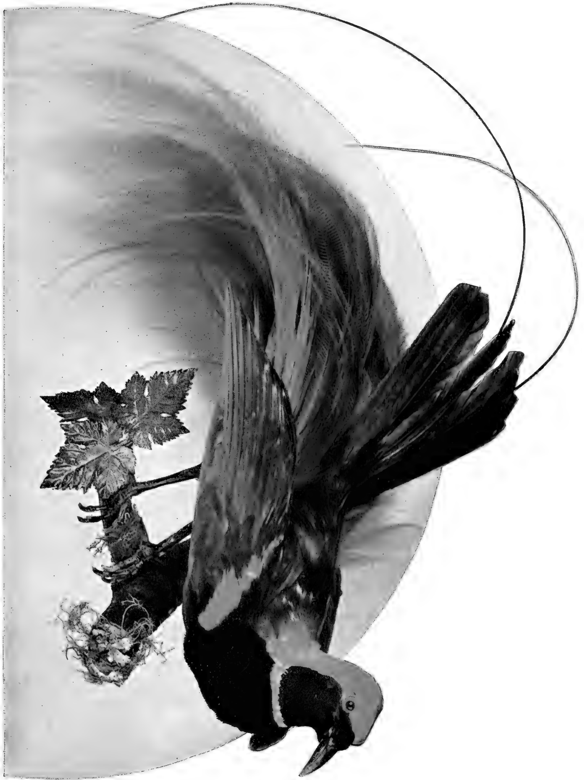
RED BIRD OF PARADISE. \frac{2}{3} Life-size.