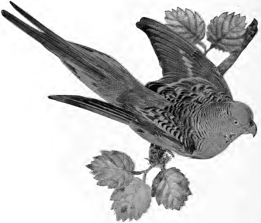
AUSTRALIAN GRASS PARRAKEET. Life-size.