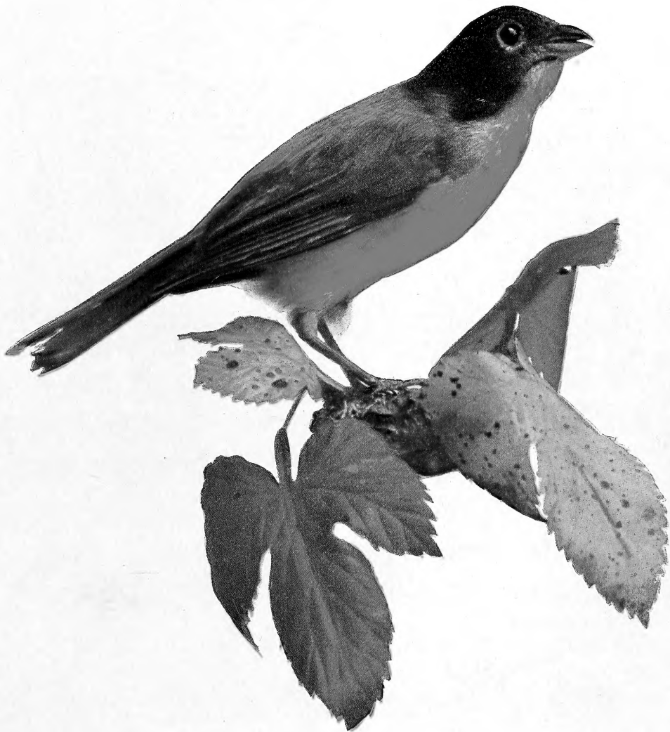
NONPAREIL. LIFE SIZE.