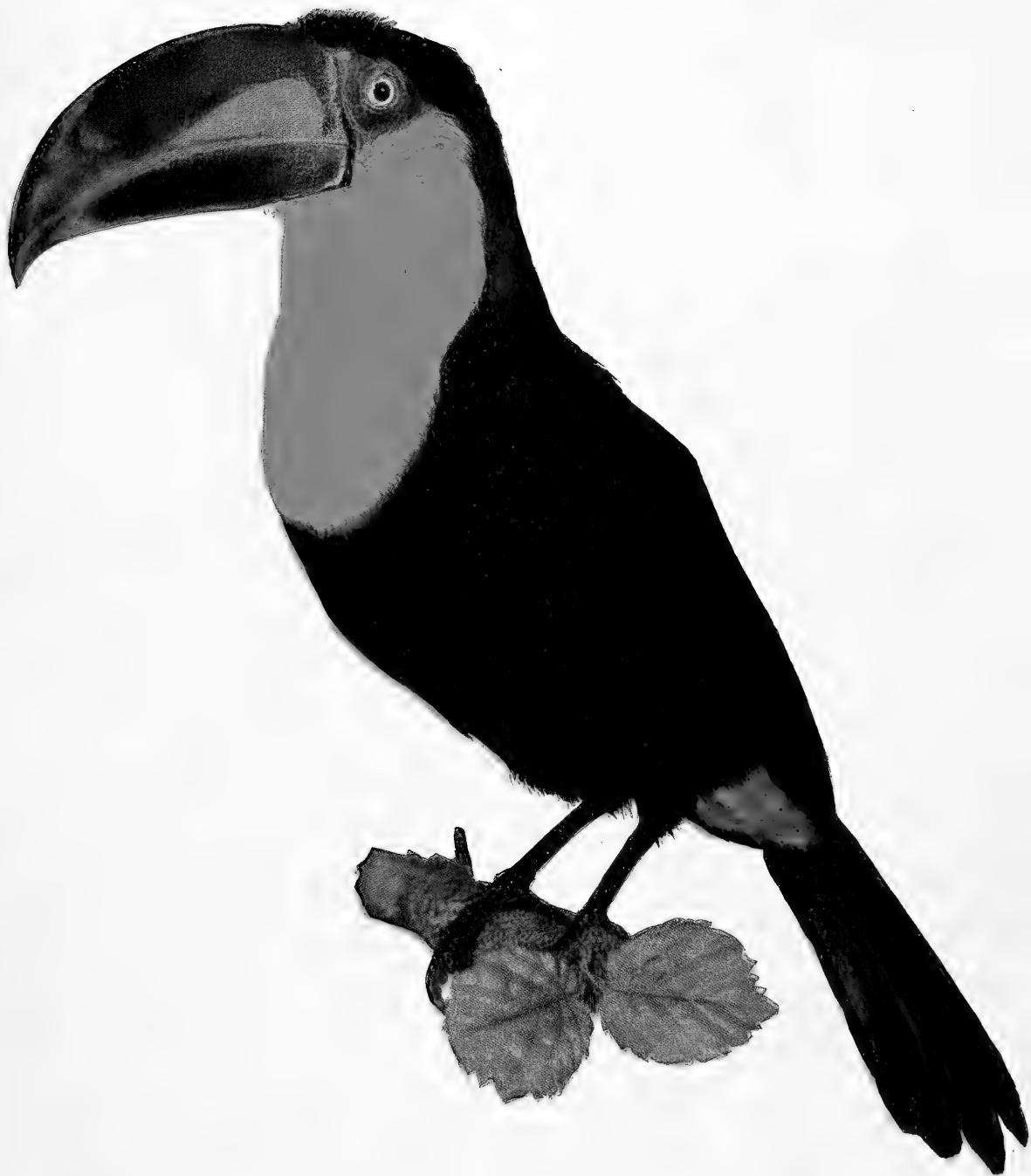
YELLOW THROATED TOUCAN. ½ Life-size.