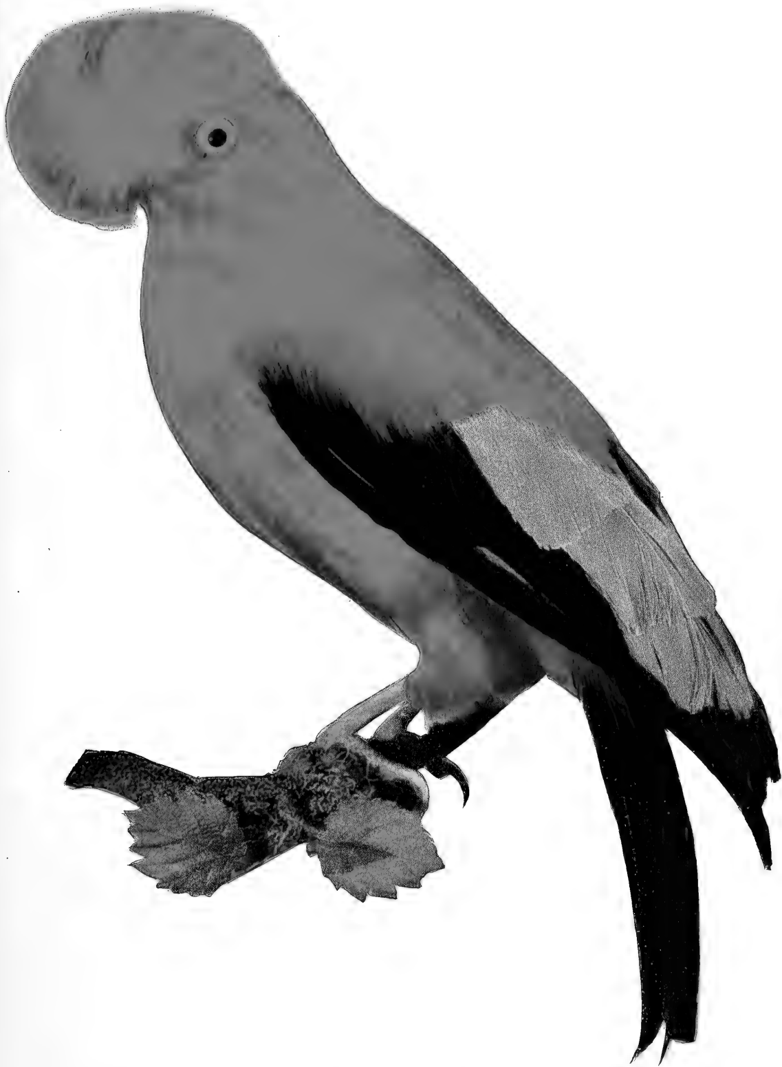
COCK-OF-THE-ROCK. ¾ Life-size.