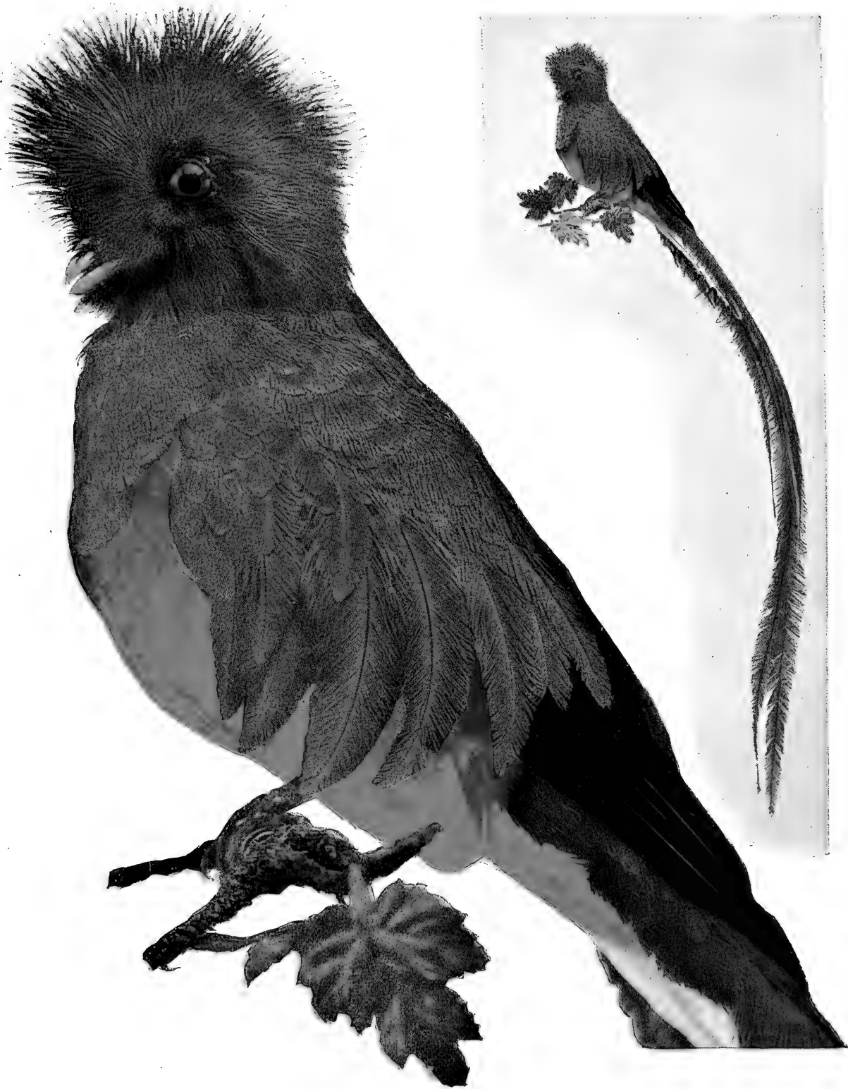
RESPLENDENT TROGON. ¾ Life-size.