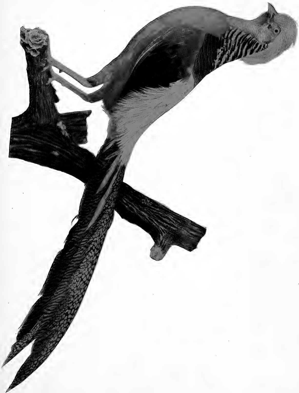
GOLDEN PHEASANT 1 1/2 / 28 Life-size. Tail somewhat shortened.