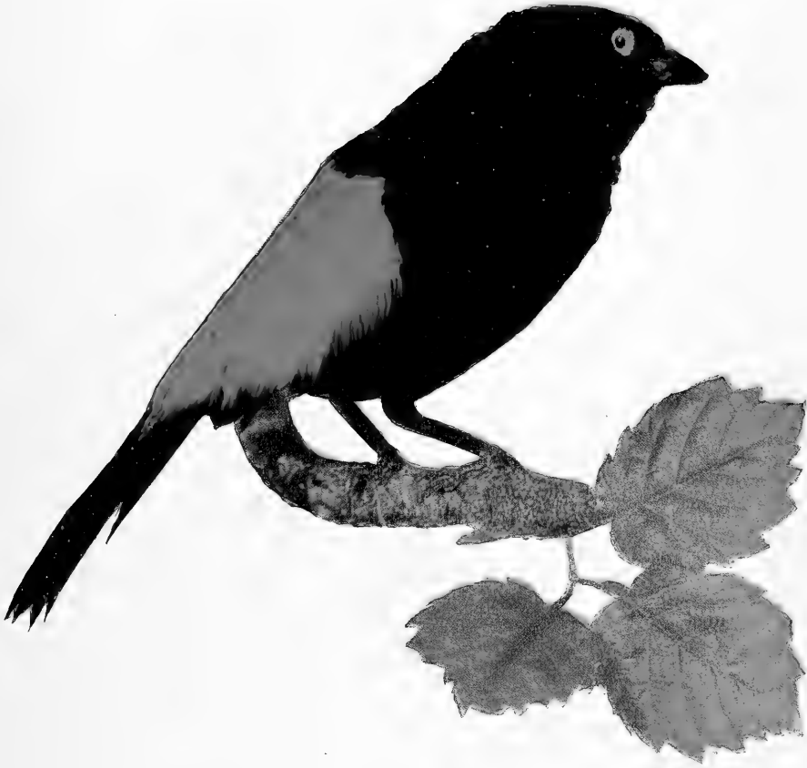
RED RUMPED TANAGER. Life-size.