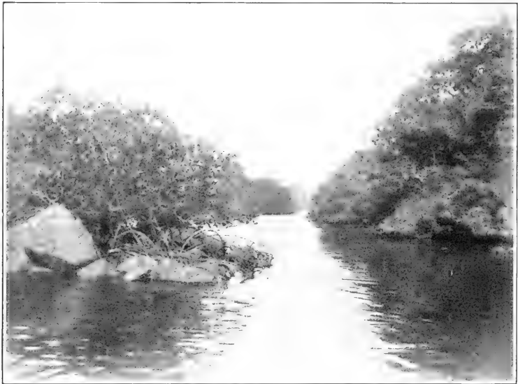
UPPER: COASTAL FOREST ON PULO JIMAJA, ANAMBA ISLANDS, THE HOME OF HORIZILLAS MAGNIROSTRIS AND AETHOPYGA SIPARAJA OCHROPYRRHA .