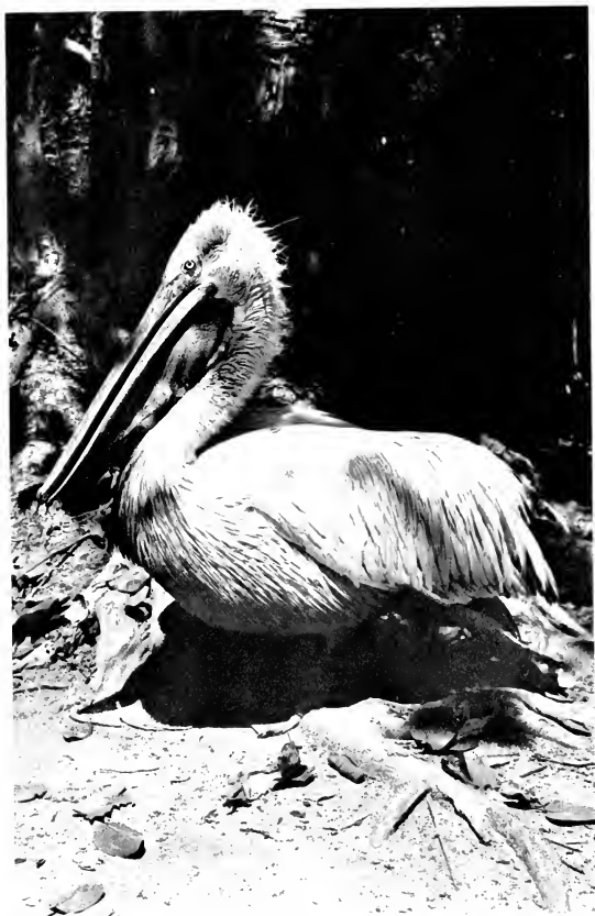
THE GREY PELICAN, (PELECANUS PHILIPPENSIS) (A bird of the Plains)