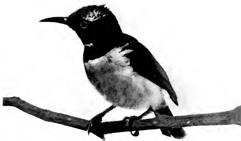
THE YELLOW SUNBIRD. (ARACHNEC-THRA ZEYLONICA)