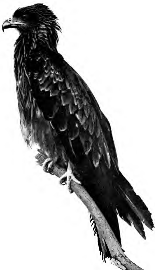
THE INDIAN KITE. (MILVUS GOVINDA)