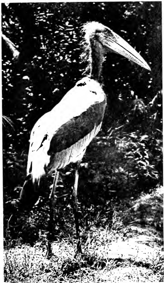
THE INDIAN ADJUTANT. ( LEPTOPTILUS DUBIUS )