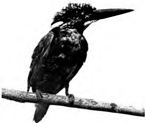
THE COMMON KINGFISHER. (ALCEDO ISPIDA) (One of the British birds found in India)