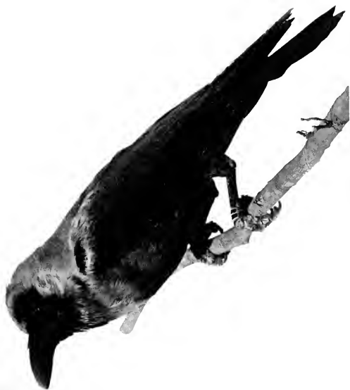
THE GREY-NECKED CROW. ( CORVUS SPLENDENS .)