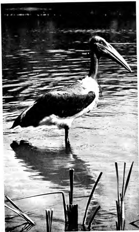
THE INDIAN ADJUTANT. (LEPTOPTILUS DUBIUS)