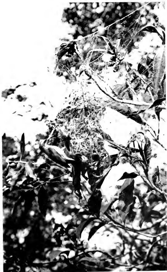
LOTEN'S SUNBIRD (HEN) ABOUT TO ENTER NEST