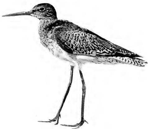
THE REDSHANK. (TOTANUS CALIDRIS) (One of the British birds found in India)