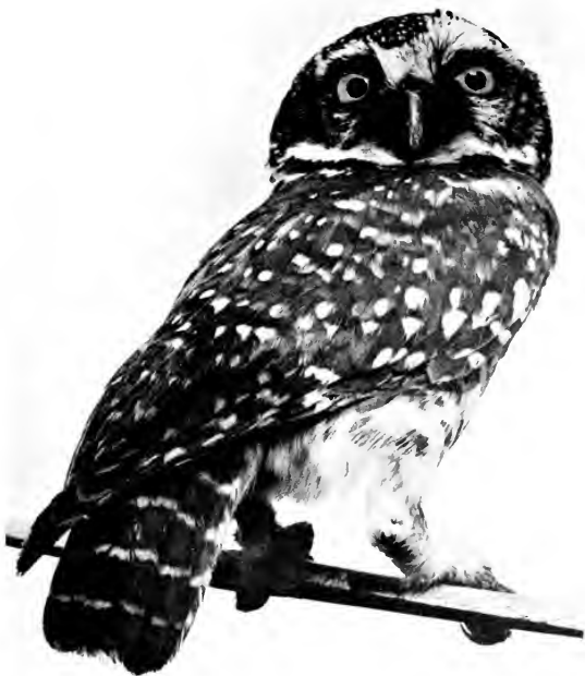
THE INDIAN SPOTTED OWLET. (ATHENE BRAMA)