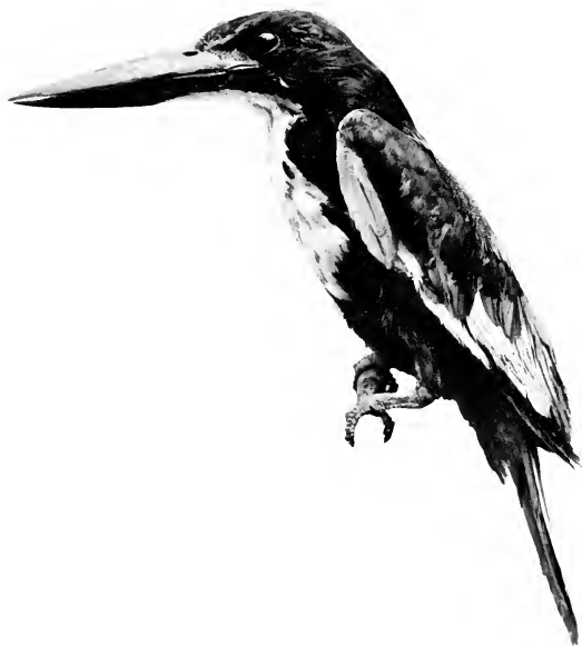
THE WHITE-BREASTED KINGFISHER. (HALCYON SMYRNENSIS)