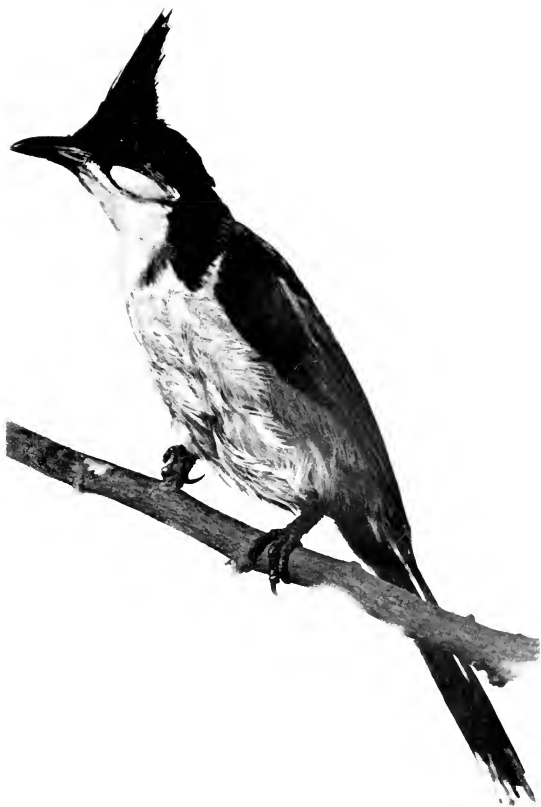
THE BENGAL RED-WHISKERED BULBUL. ( OTOCOMPSA EMERIA )