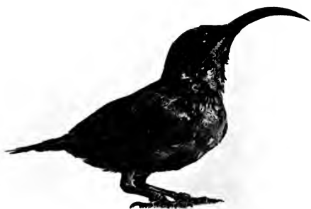
LOTEN'S SUNBIRD. (ARACHNEC-THRA LOTENIA) (Note the long curved bill, adapted to insertion in flowers)