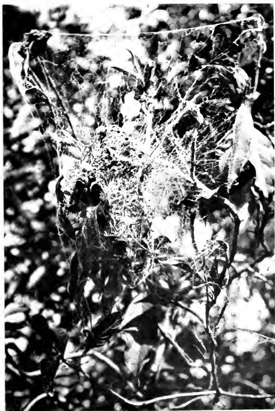
NEST OF TOTEN'S SUNBIRD Notice that it is built in a spider's web