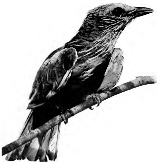
THE INDIAN ROLLER, OR "BLUE JAY." (CORACIAS INDICA)