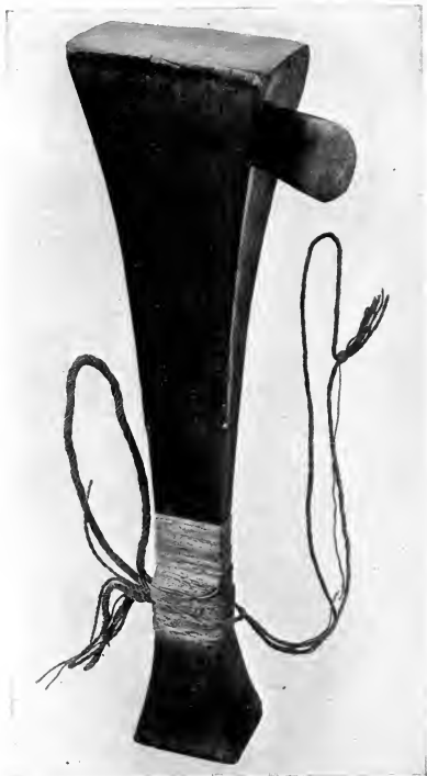
WARCLUB WITH IRON BLADE