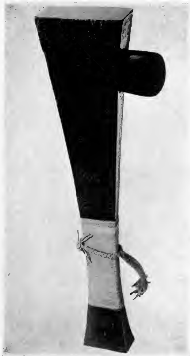
ENGRAVED WARCLUB WITH STONE BLADE