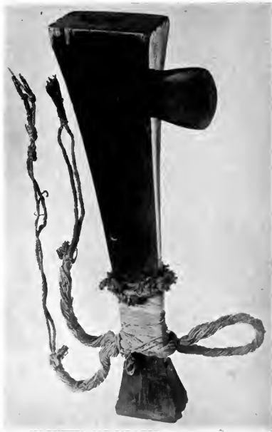
WARCLUB WITH STONE BLADE