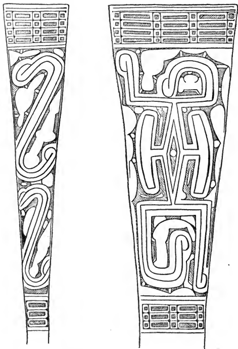
THE WARCLUB SHOWN IN PLATE I