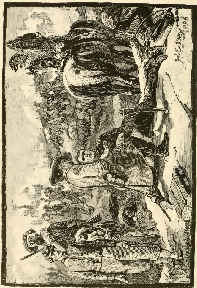
GENERAL GORDON RAISING UP GENERAL BARLOW ON THE BATTLE-FIELD (SEE PAGE 31).