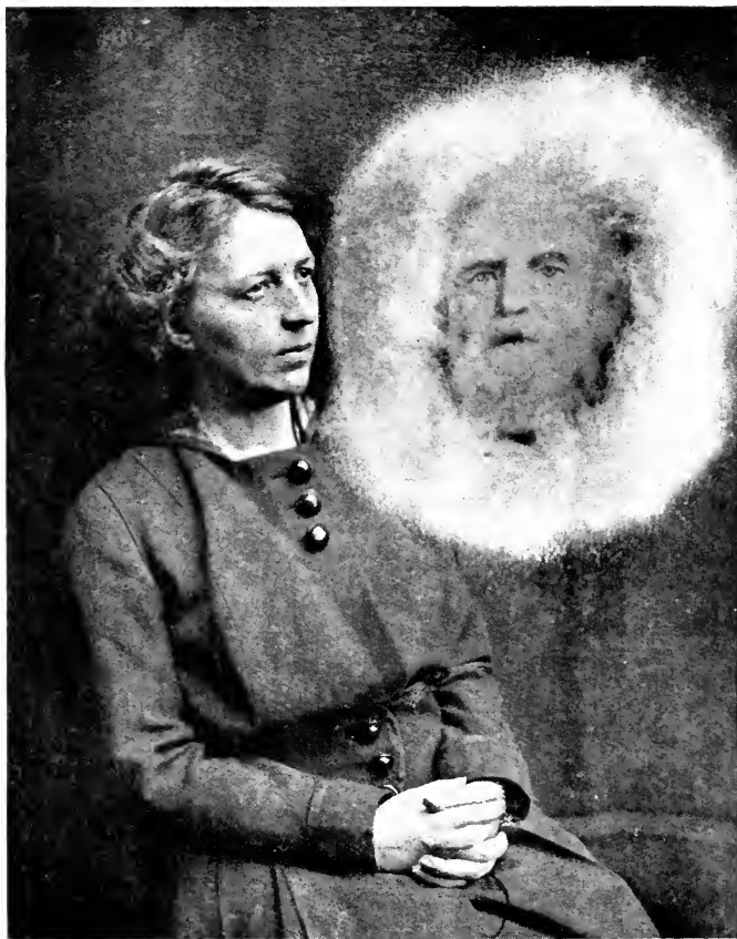
Psychic Photograph of W. T. Stead given at Crewe, 1915. See Introduction.