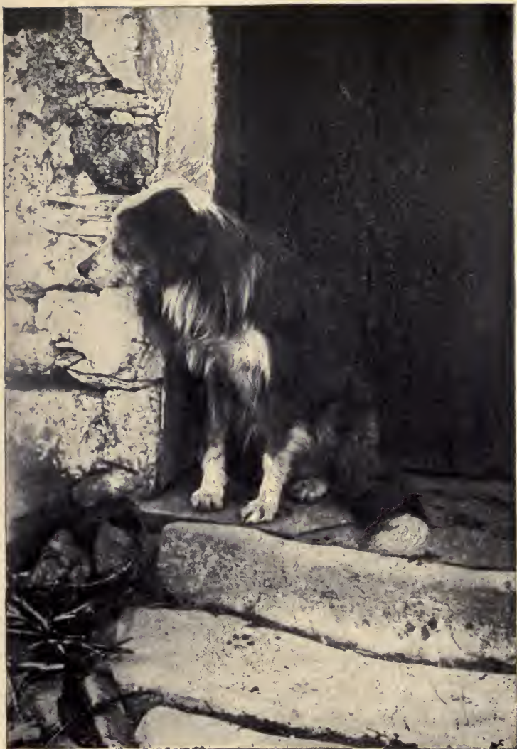
“The gray Knight.”