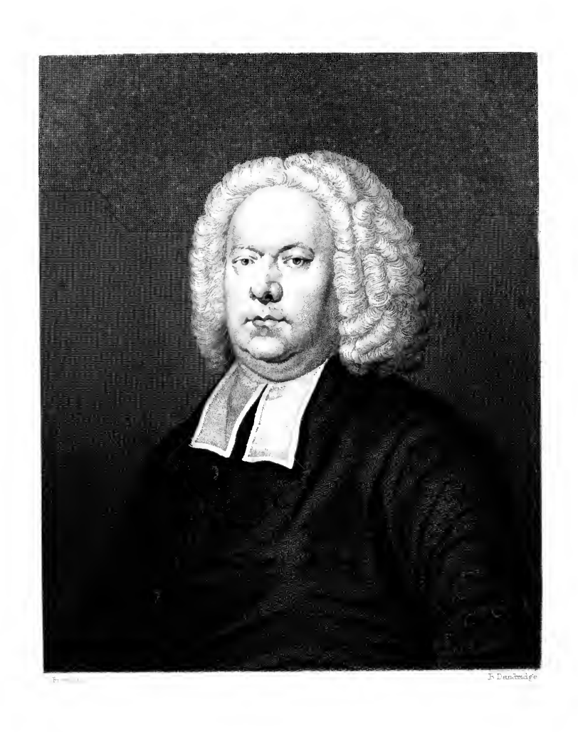
Chamas ("wac en 2)2)