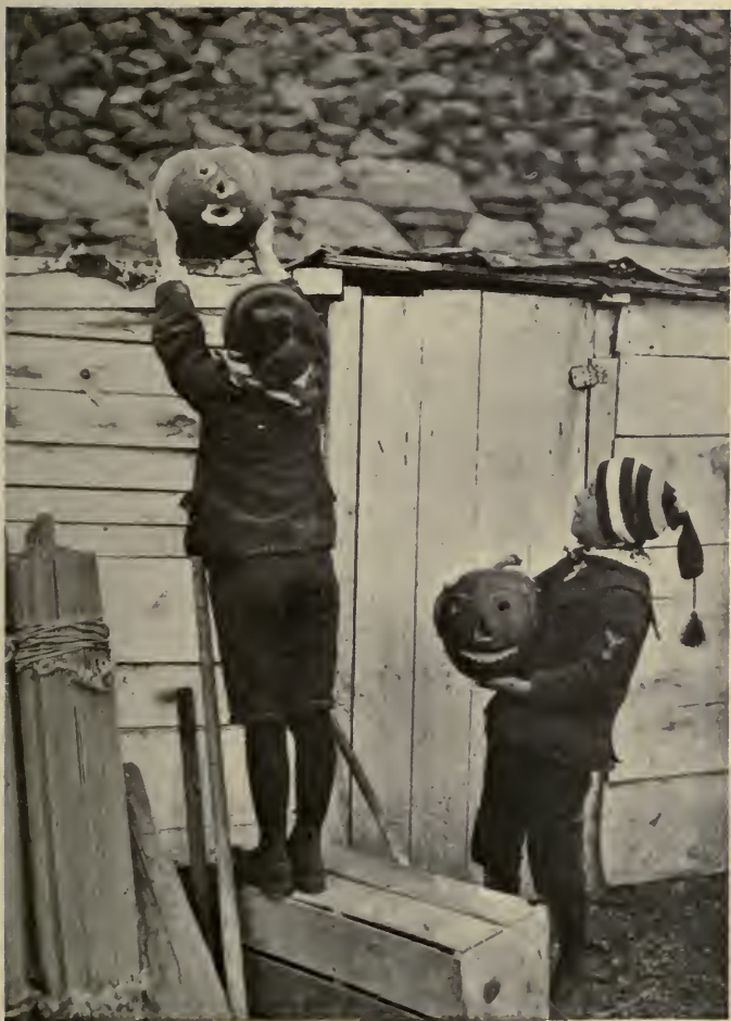
NO HALLOWE'EN WITHOUT A JACK-O'-LANTERN.