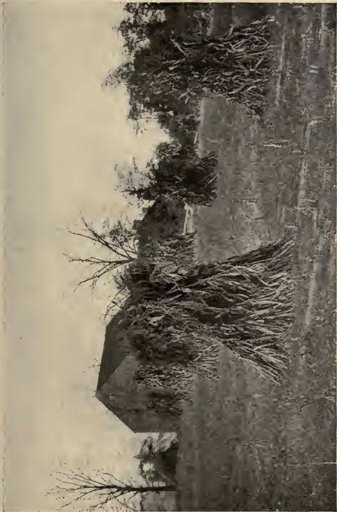
IN HALLOWE'EN TIME.