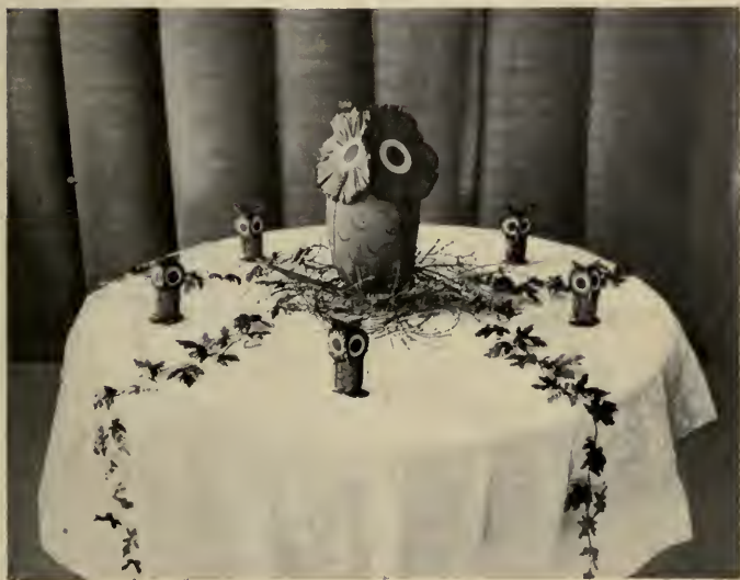
AN OWL TABLE. HALLOWE'EN TABLES, I.