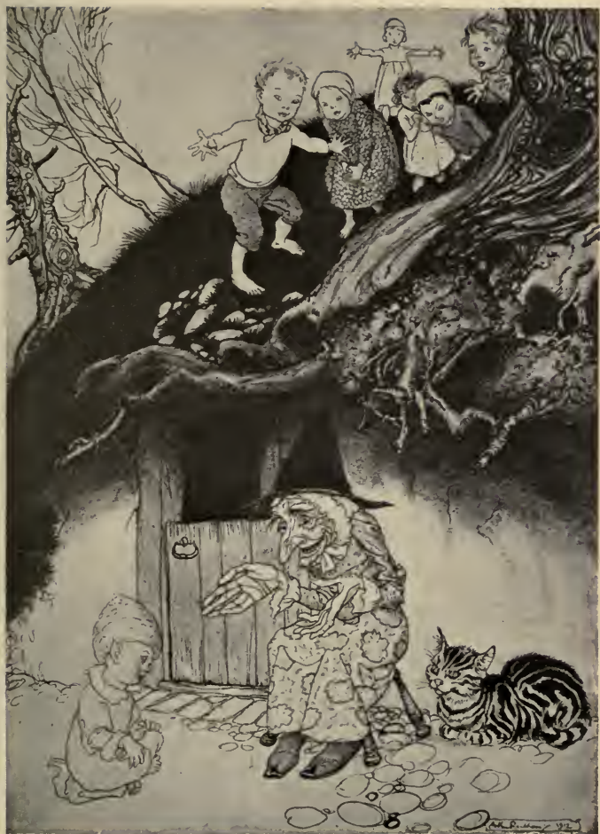
THE WITCH OF THE WALNUT-TREE.