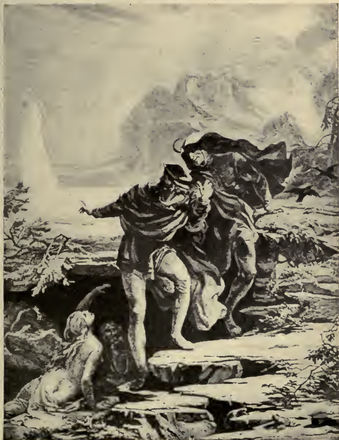
THE WITCHES' DANCE (VALPURGISNACHT.) From Painting by Von Kreling.