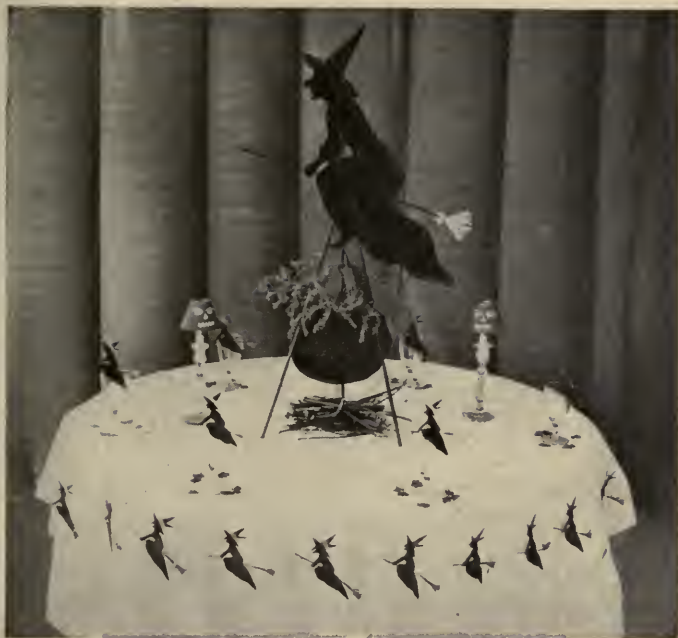
A WITCH TABLE.