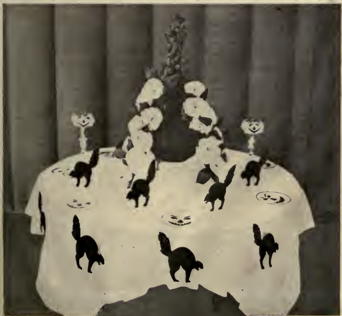
A BLACK-CAT TABLE. HALLOWE'EN TABLES, II.