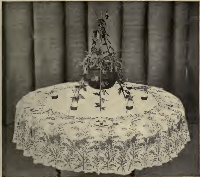
A WITCHES'-CALDRON TABLE.