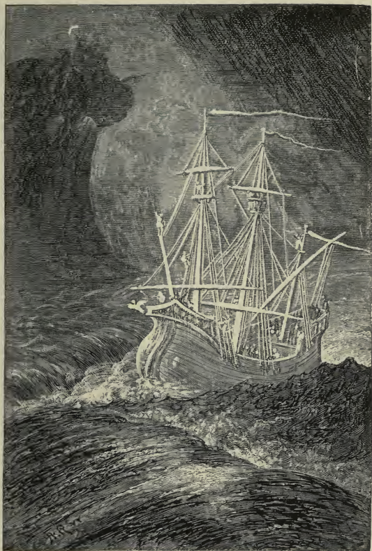
"LOOK! THERE IS THE FLYING DUTCHMAN"