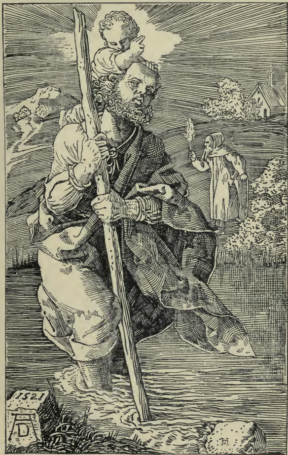
ST. CHRISTOPHER AND THE CHILD