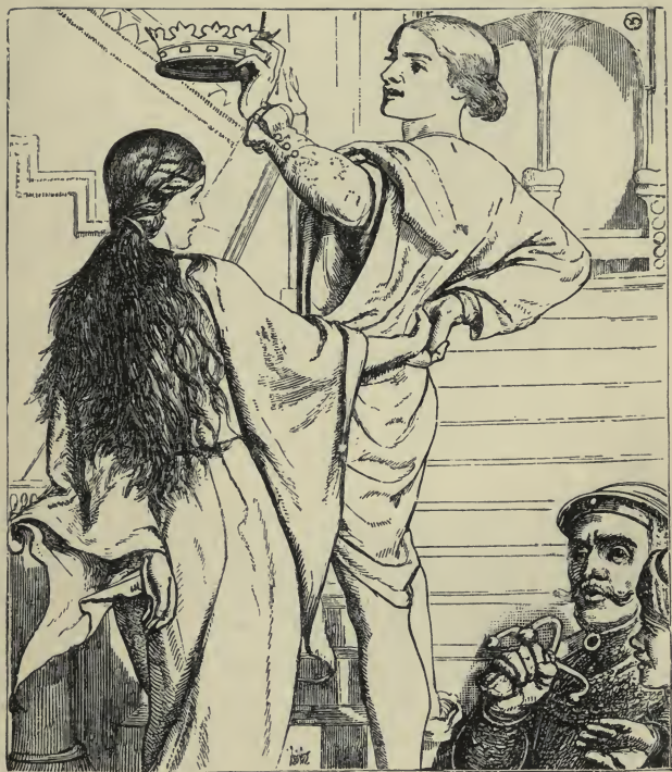
KING COPHETUA OFFERING HIS CROWN