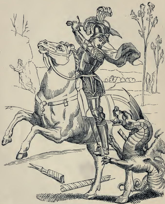
RAPHAEL'S ST. GEORGE