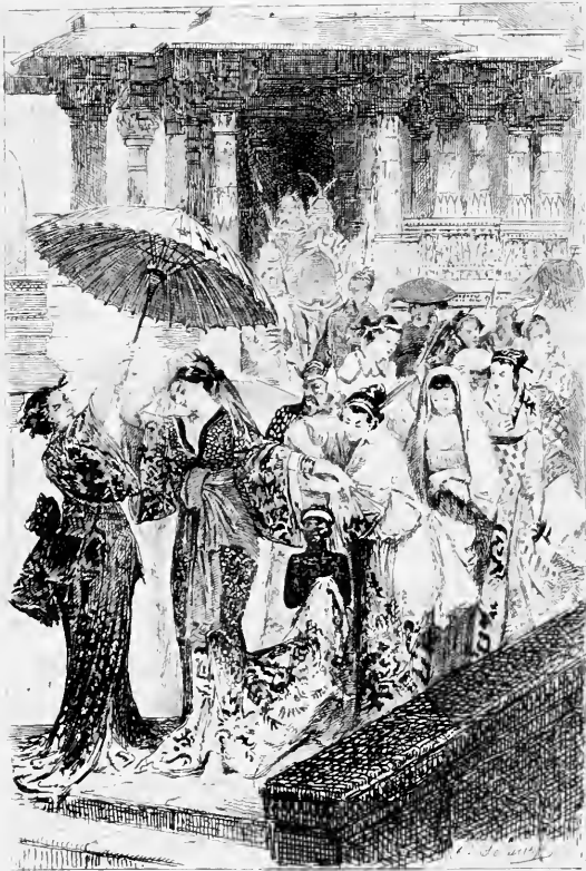
A. Delaunay, F. Noël & Co.