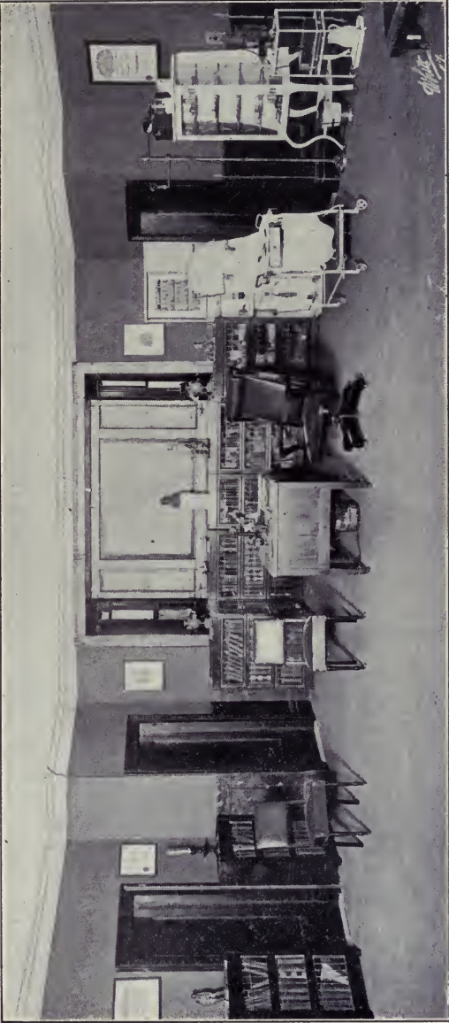
THE STAGE OF THE BELASCO THEATRE, NEW YORK, SET FOR ACTS I AND III OF "THE BOOMERANG"