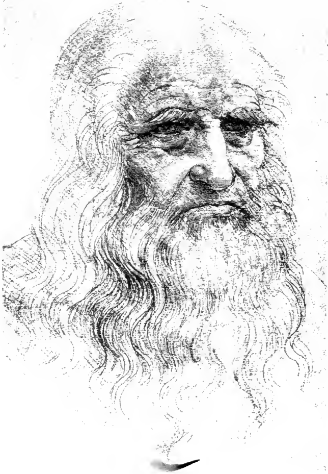
PORTRAIT OF LEONARDO DA VINCI