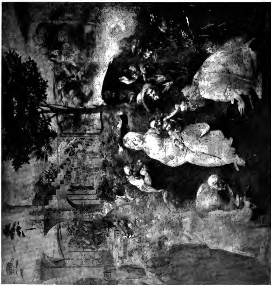
LEONARDO DA VINCI ADORATION OF THE MAGI [UNFINISHED] UFFIZI GALLERY, FLORENCE