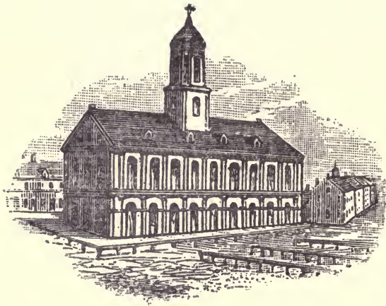
FANEUIL HALL IN 1760.