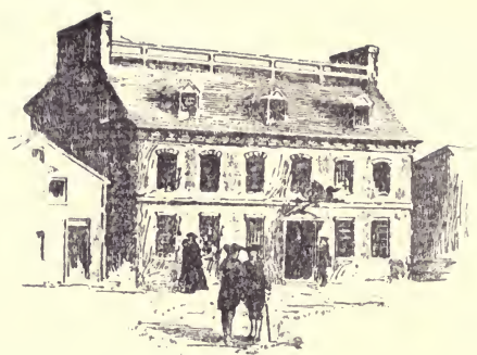
THE GREEN DRAGON TAVERN.