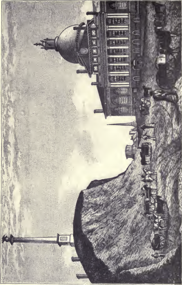
DEMOLITION OF BEACON HILL.