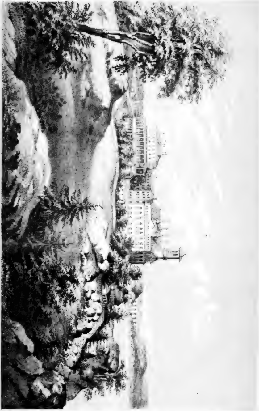
View from Summit of Mt. Central, N. York, looking N.W.