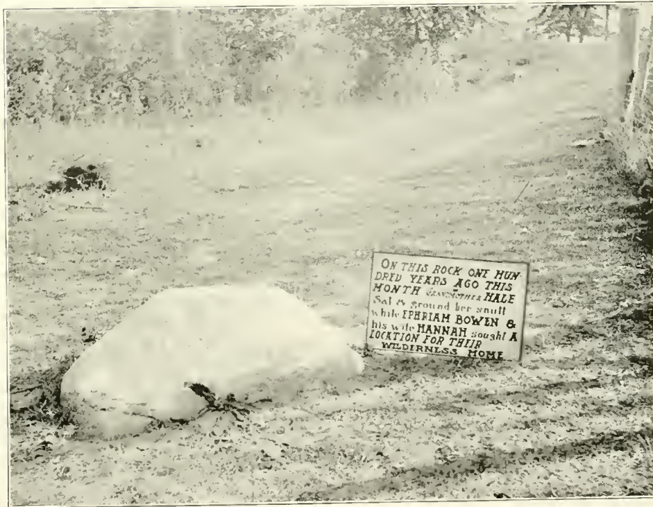
The "Old Trail" running back into the distance. In their "Shaker Wagon," Ephraim Bowen and family drove over this part of the trail soon after entering upon their own land.