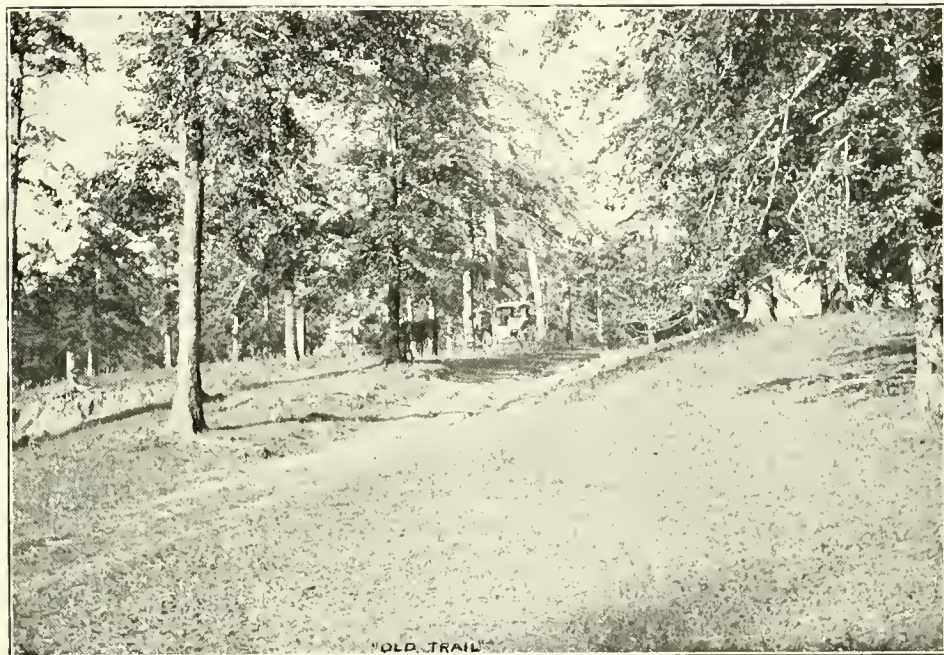
View of the "Old Trail" leading from the spring and "Old Rock" toward the house. After leaving the wagon at the "Old Rock," Ephraim Bowen and wife must have walked over this part of the "Trail" on their way to the spot where they located their cabin.