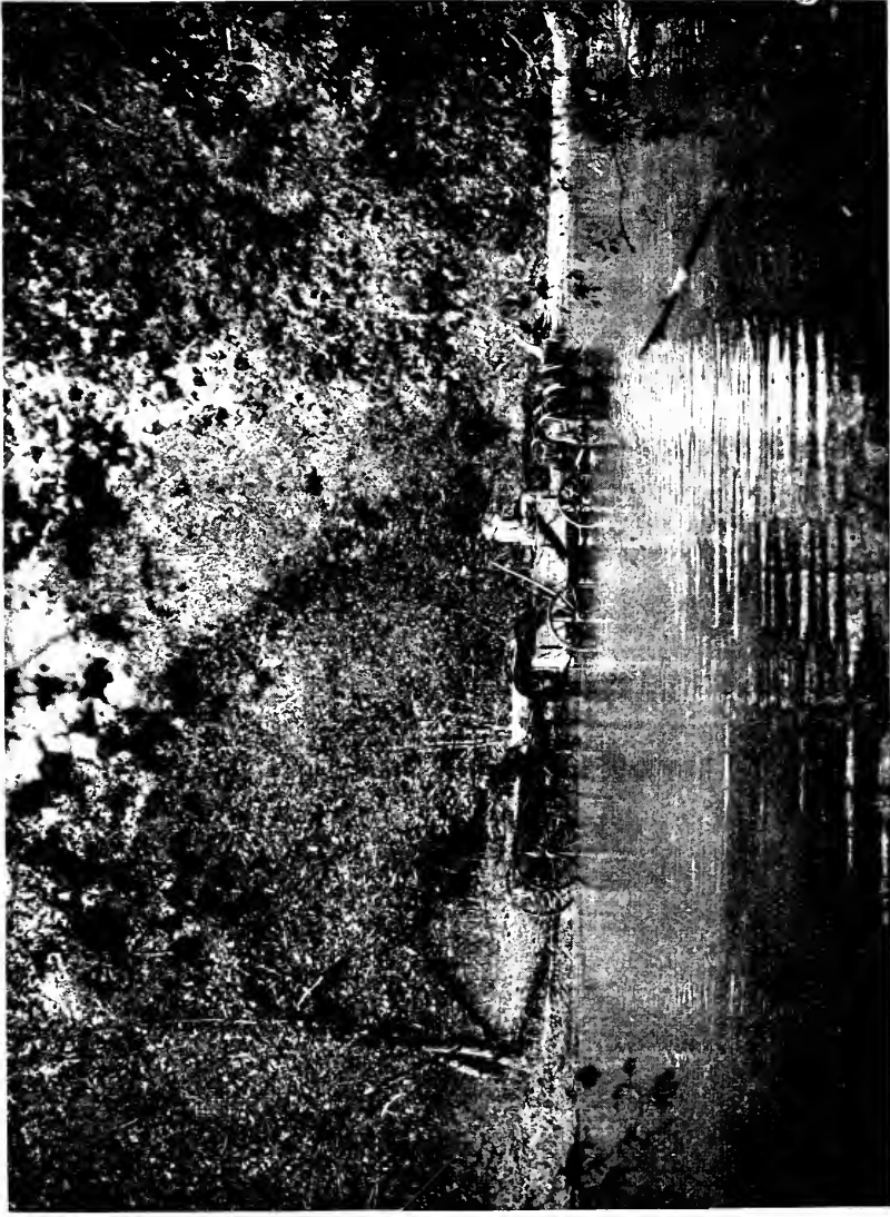
In the country about Lincoln's first home they ford most of the streams rather than build bridges