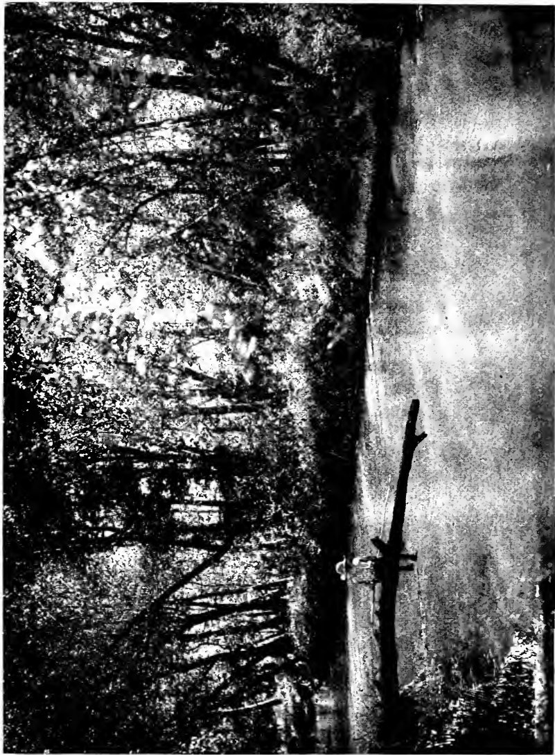
Nolan Creek, in which little Abraham was nearly drowned