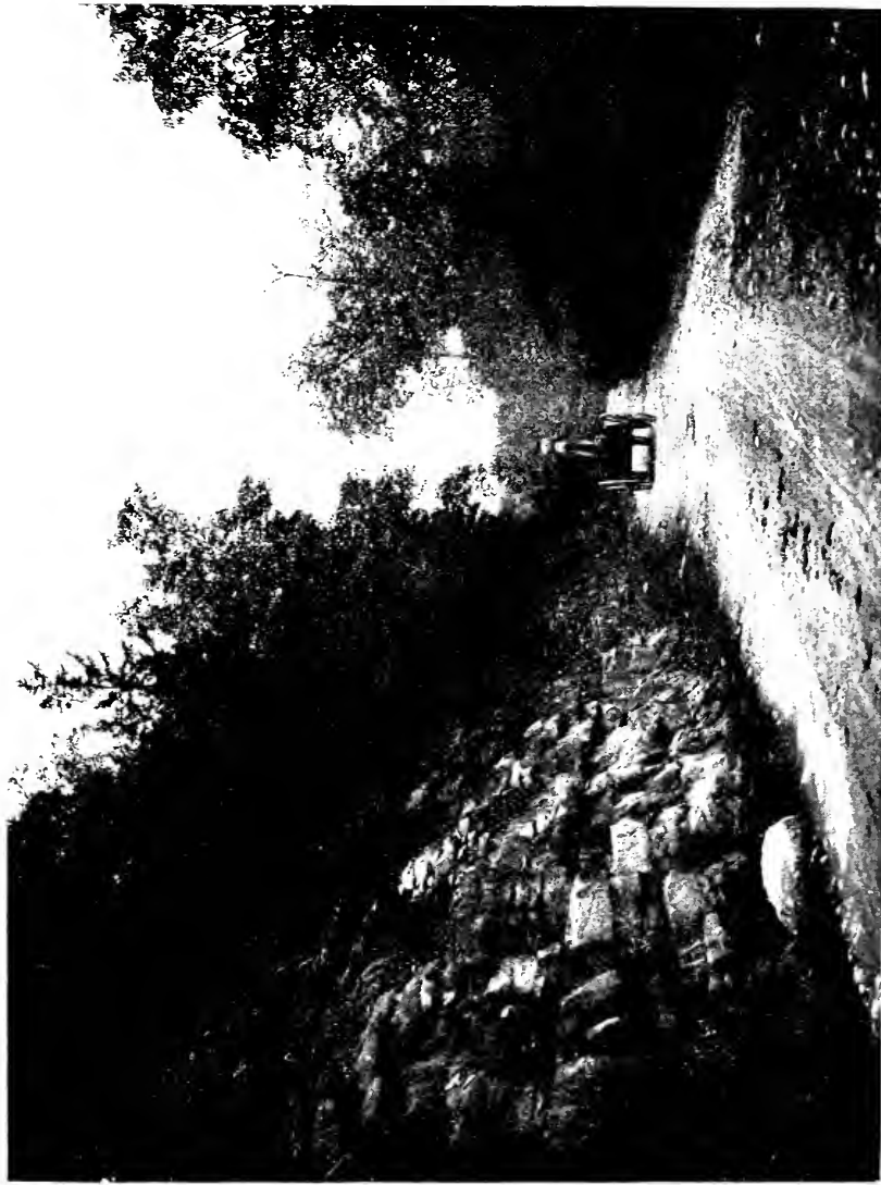
The old Louisville and Nashville pike, which runs through the Lincoln farm