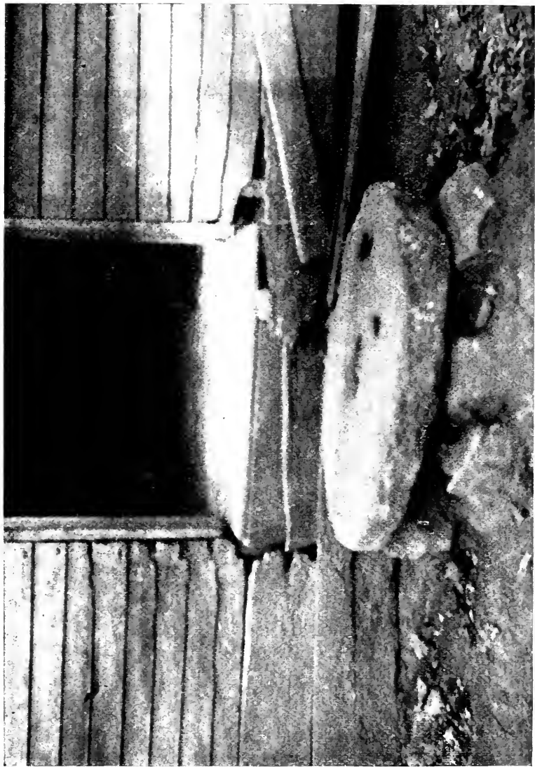
The Lincoln family mill stone which was used to grind the family meal has for many years been used as a door "stoop" to the house that was built upon the farm after the Lincolns went away