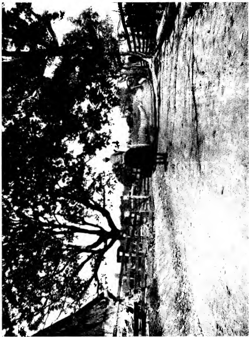
On the Magnolia Road which runs from Hodgenville to the Lincoln birthplace farm