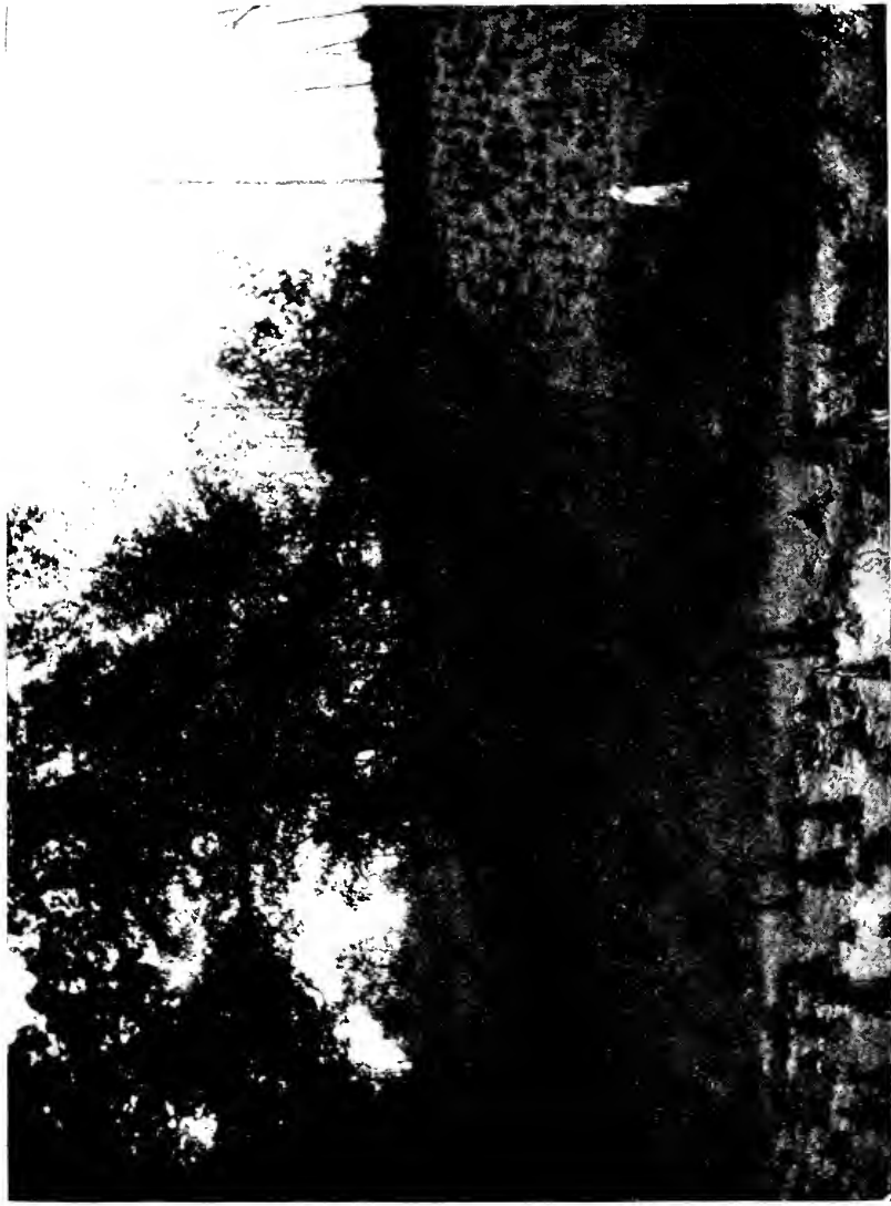
The scene of Lincoln's birth. The pole on the knoll at the right marks the spot where the birthplace cabin originally stood.