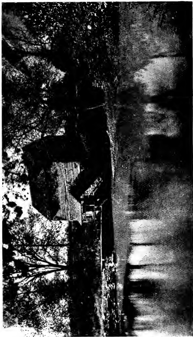
The old Nolan Mill, around which little Abraham used to play