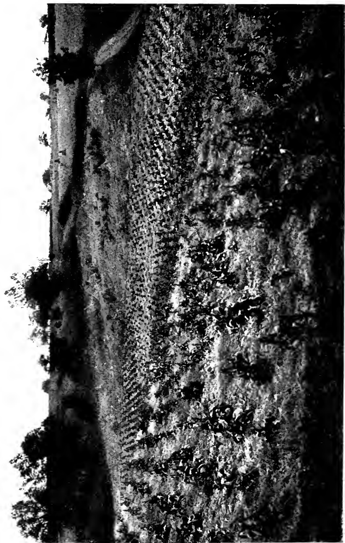
A bit of the farm on which Abraham Lincoln was born