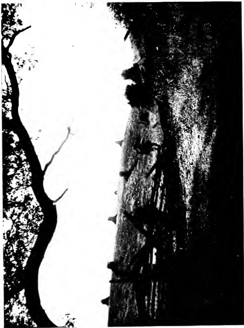
On the edge of the Lincoln birthplace farm