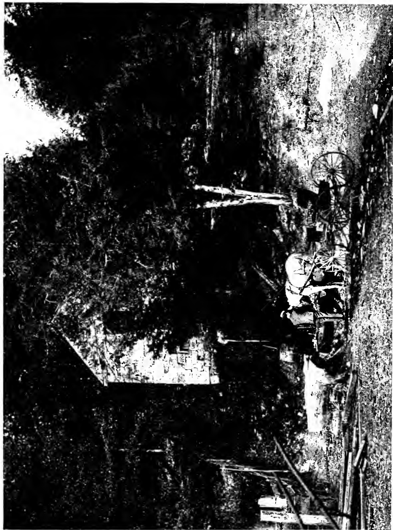
The old house on the road to the mill where little Abraham used to stop for "cookies"