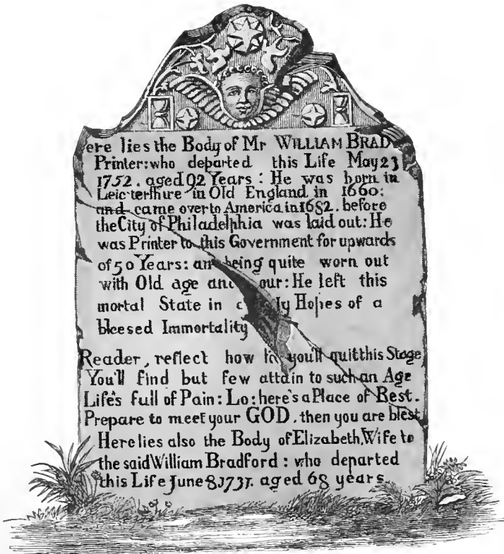
FAC-SIMILE OF THE ORIGINAL TOMBSTONE.