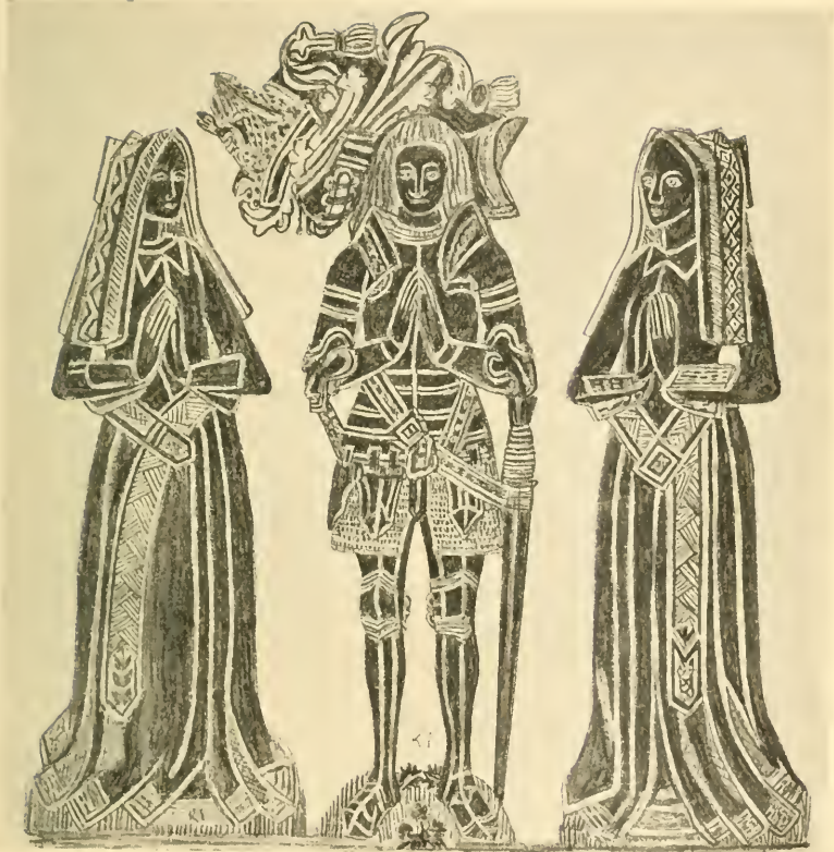
THE ACKWORTH BRASSES (ST. MARY'S, LUTON).