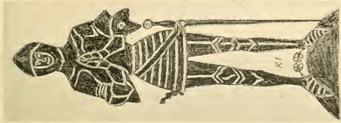
SIR JOHN MEPTYSHALE.

Example of aldermanic cloak worn over armour.