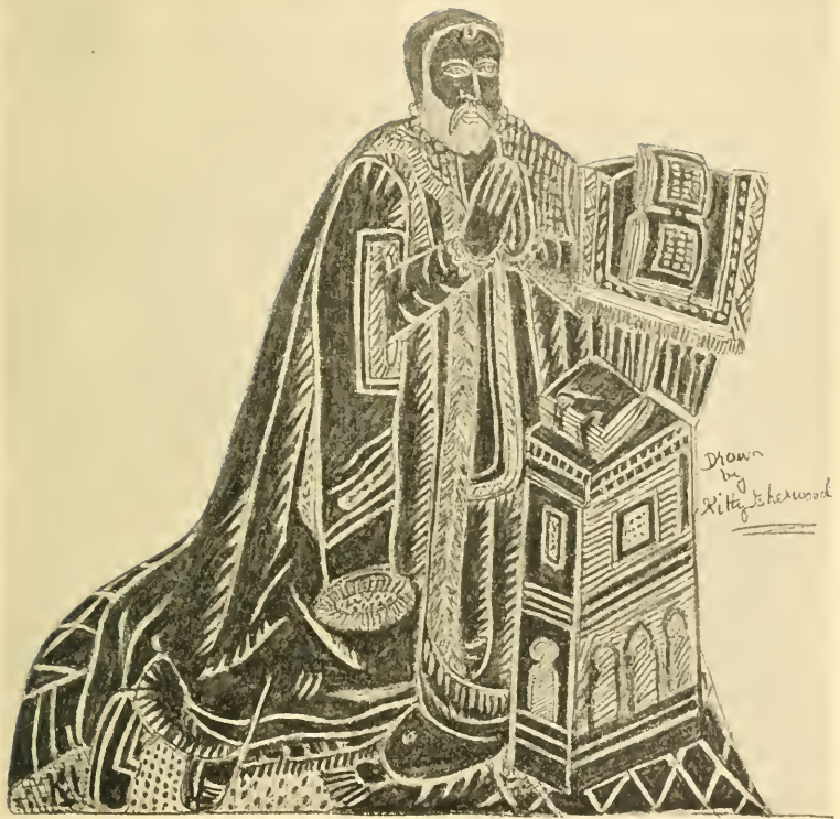
SIR ANTHONY NEWDIGATE (HAINES CHURCH).

Note a curious example of a double faldstool.