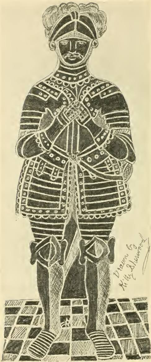
SIR JARRATE OR GERARD HARVYE (CARDINGTON CHURCH).