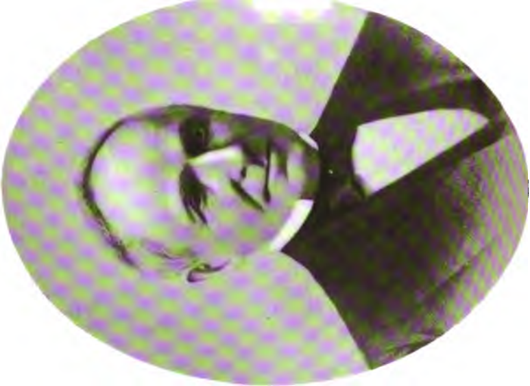
[844] GEORGE PENDLETON