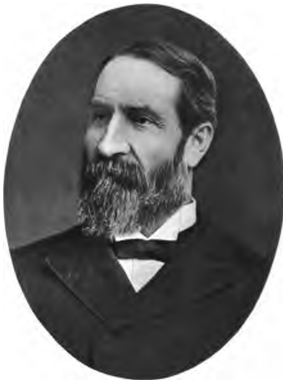
[3049] HON. GEORGE FRANKLIN PENDLETON