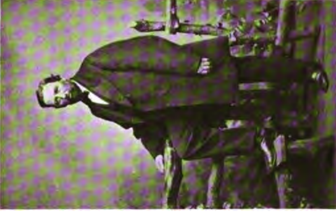
[1826] CAPT. GEORGE SAMUEL PENDELETON