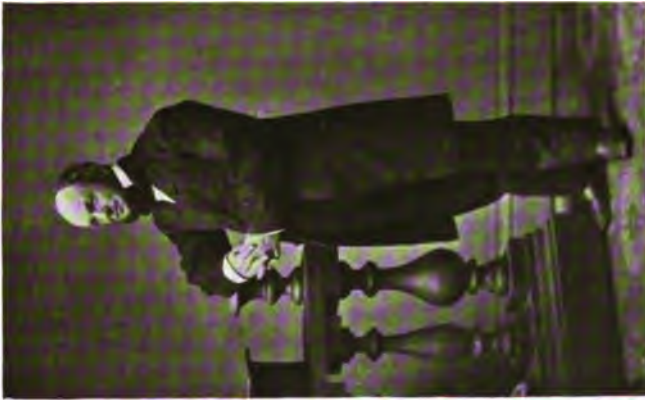
[1823] CAPT. CHARLES BABBITT PENDELETON