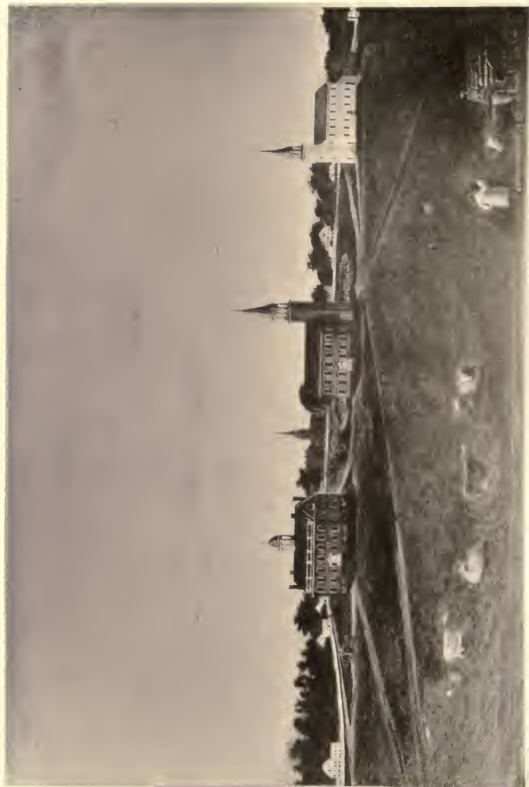
Colonial State House.