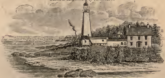
View of the Light House S. of New Haven Con. Fort Hill, the Chemical Works, East & West Rocks; New Haven seen in the distance.