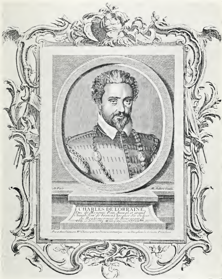
CHARLES DE LORRAINE, DUC DE MAYENNE.