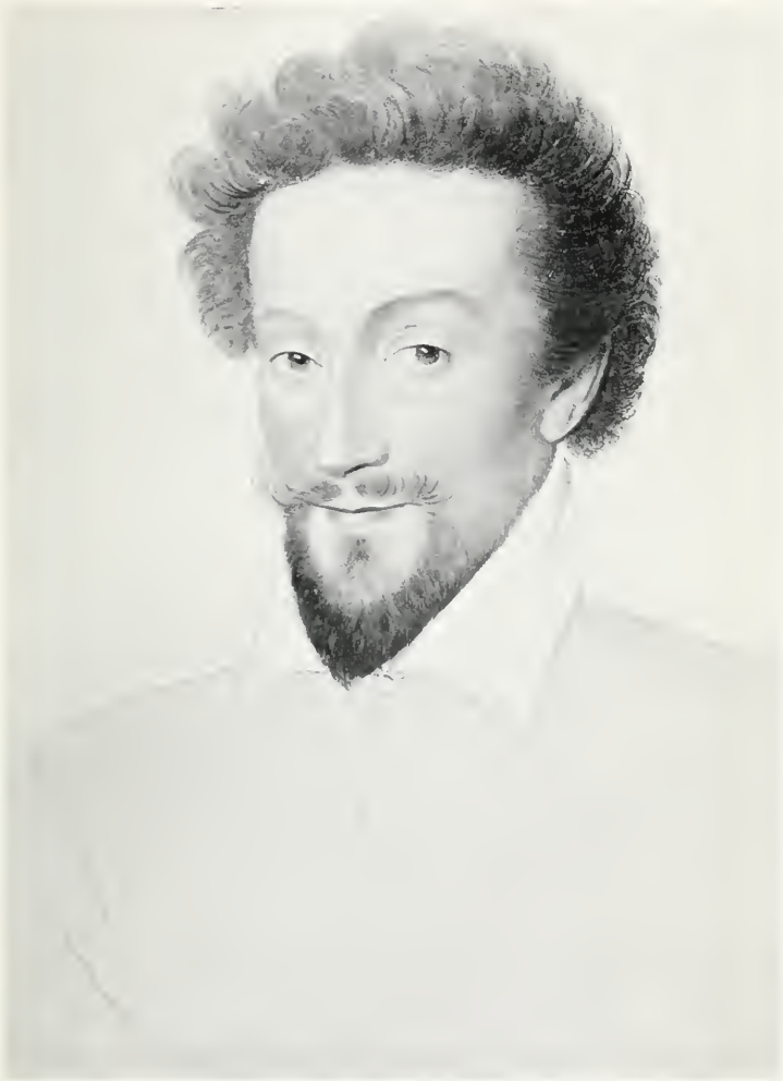
HENRI DE BOURBON, KING OF NAVARRE (AFTERWARDS HENRI IV)