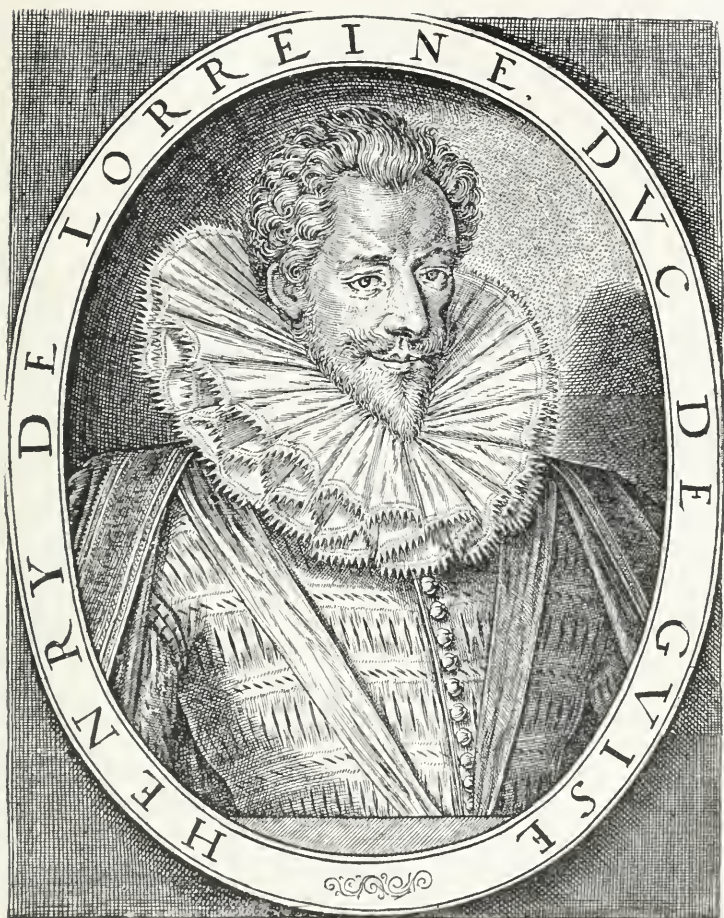
HENRY I DE LORRAINE, DUC DE GUISE, KNOWN AS "LE BALAFRÉ".