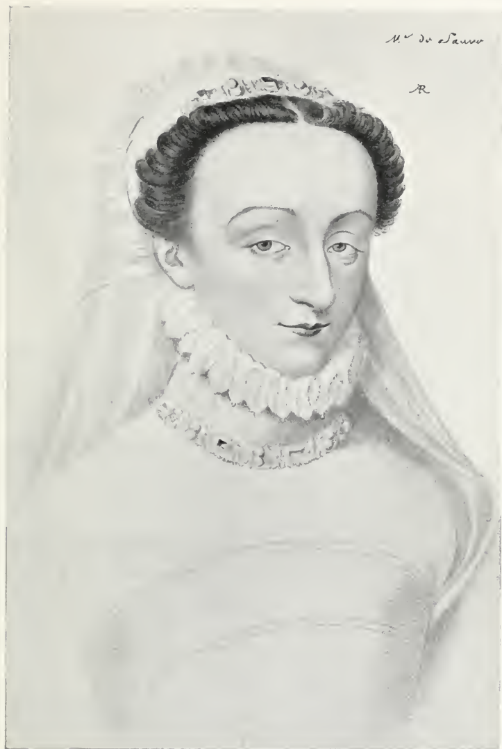
CHARLOTTE DE BEAUNE, DAME DE SAUVE, AFTERWARDS MARQUISE DE NOIRMOUTIERS.