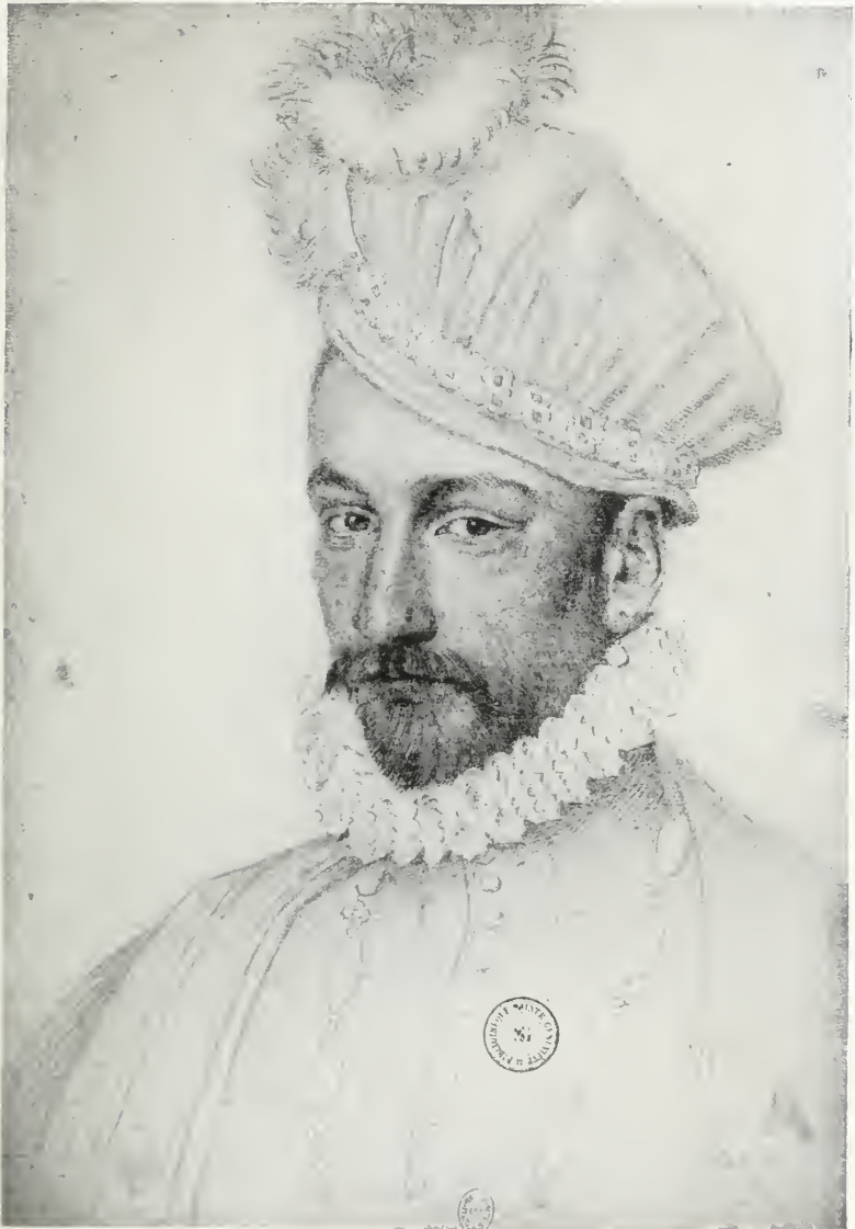
CHARLES IX IN 1570.

after a drawing in the Bibliothèque Nationale by François Clouet.