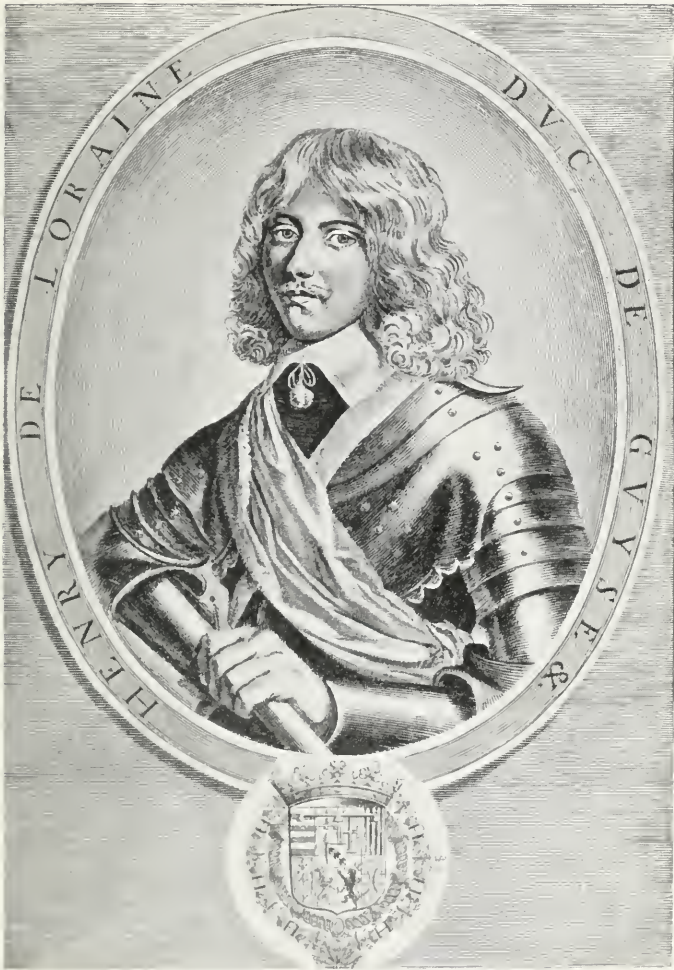
HENRY II DE LORRAINE, DUC DE GUISE.