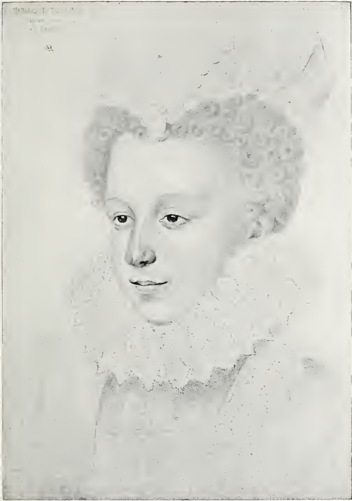
MARGUERITE DE VALOIS, QUEEN OF NAVARRE (" LA REINE MARGOT ").