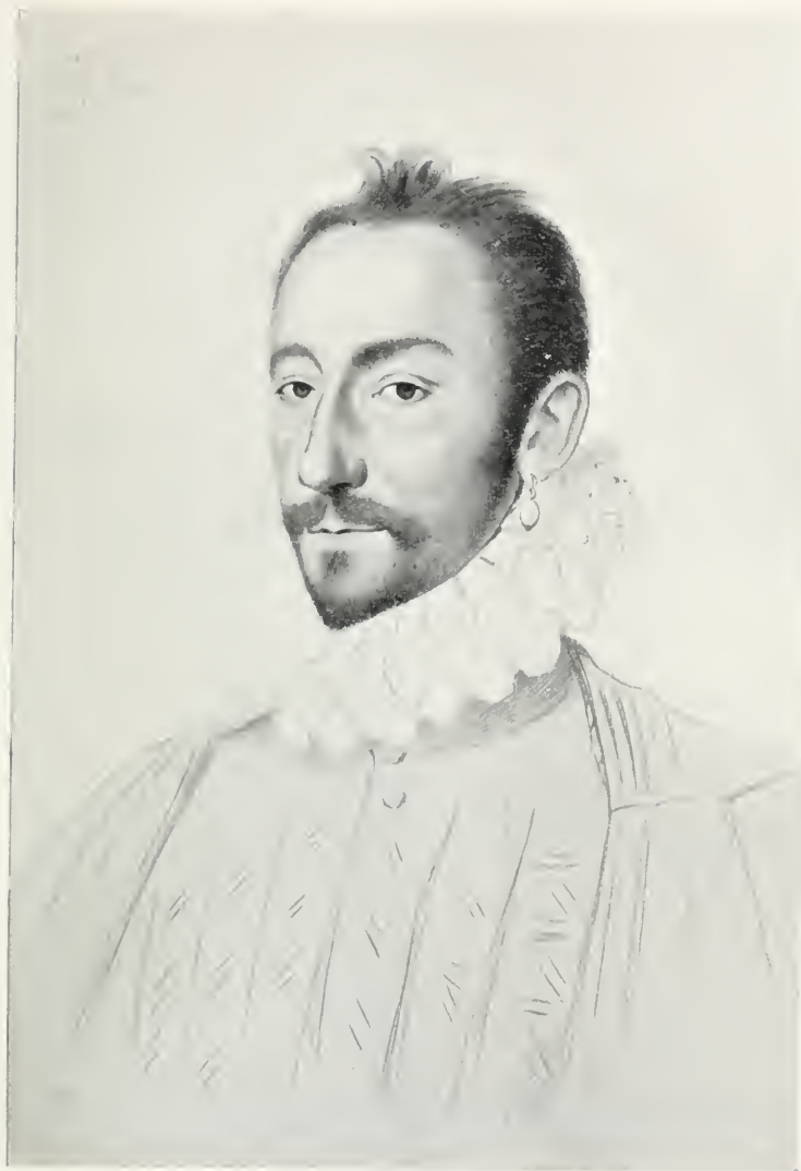
CHARLES DE BALZAC D'ENTRAGUES.