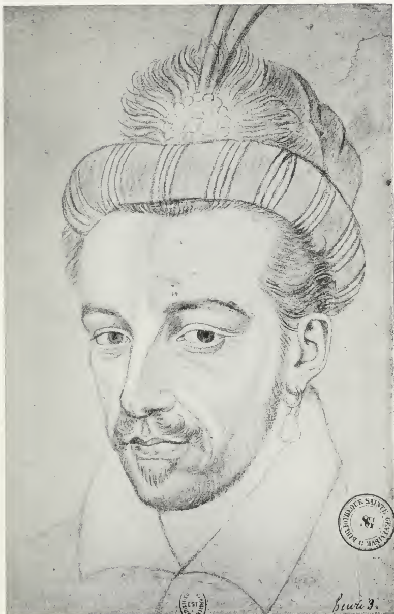
DUKE OF ANJOU, AFTERWARDS HENRI III.

From a photograph by A. Giraudon, Paris, after an anonymous drawing in the Bibliothèque Nationale.