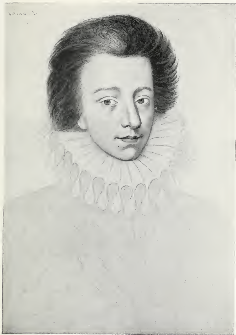
JEAN LOUIS DE NOGARET DE LA VALETTE, DUC D'ÉPERNON.