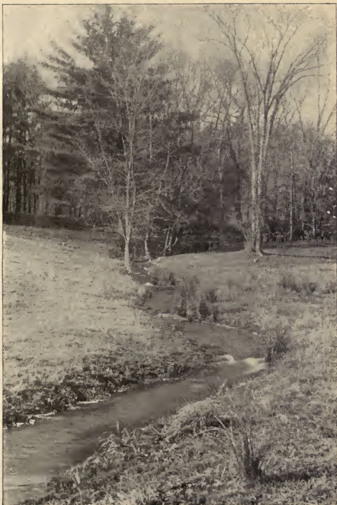
"Now it glides into the meadow."