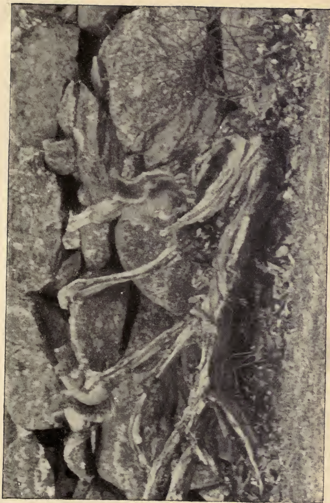
In the Old Stone Wall.