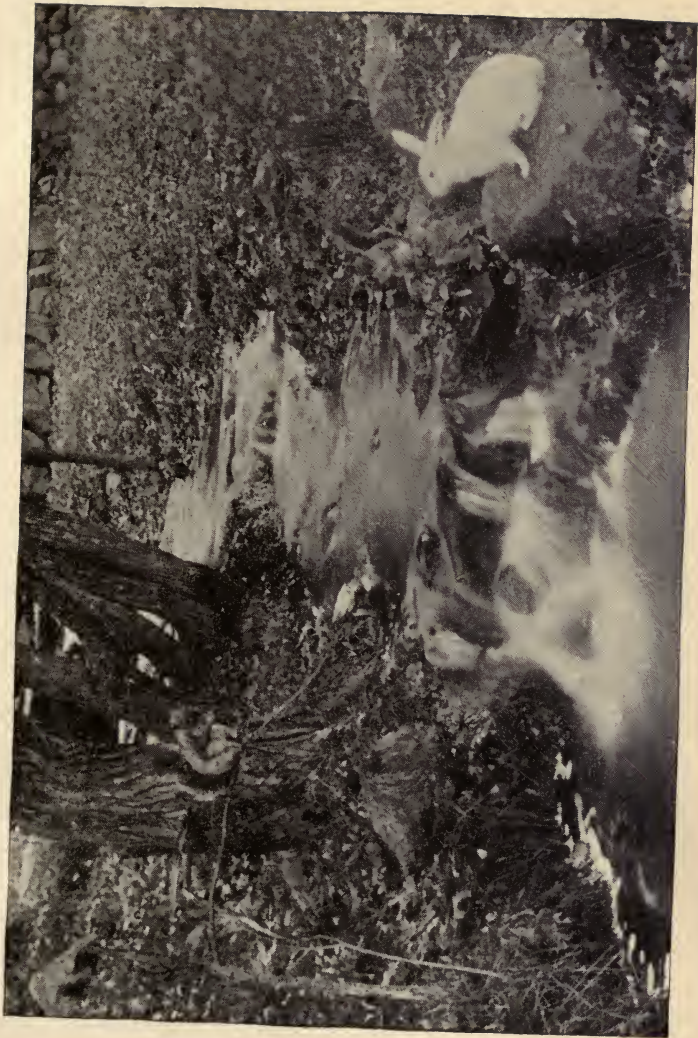
By the Brookside. Where is Redbreast ?