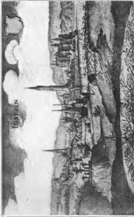
Rhein im Innern, Mitte des 17. Jahrhunderts. Sitz des katholischen Staatserbis in früheren Jahren.