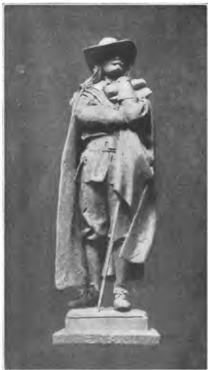
Das Leisler-Denkmal in New Rochelle, N. Y.