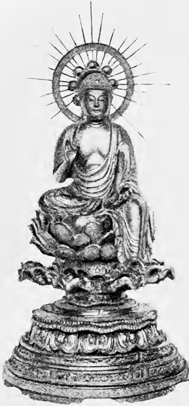
I. MI-RÔ-KOU, OR MAITRÊYA.