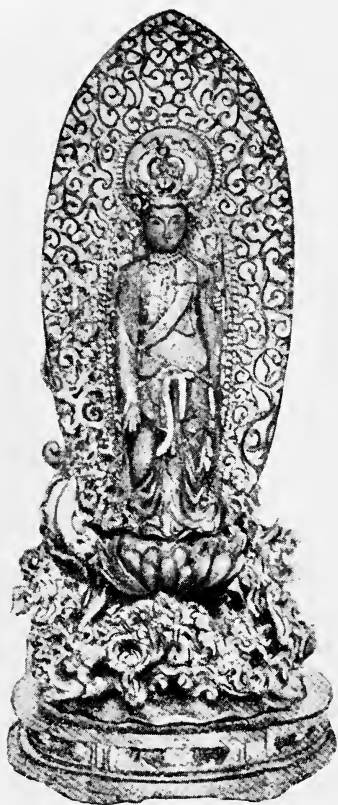
5. AMIDA (BUDDHA AMITĀBHA).