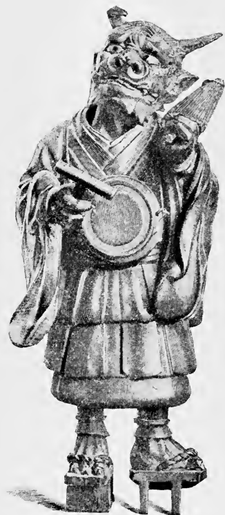
6. THE DEVIL AS A BUDDHISTIC MONK.