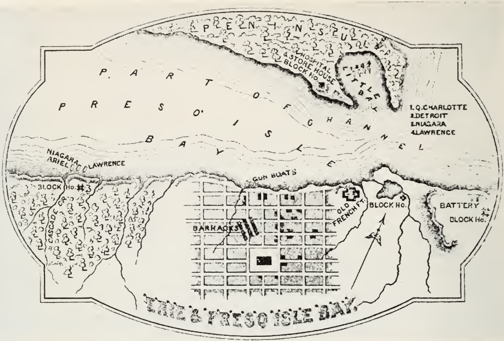
ERIE HARBOR DURING THE WAR OF 1812