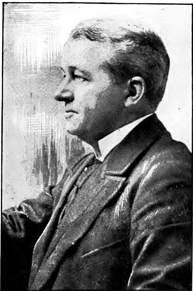
JUDGE NATHAN GOFF