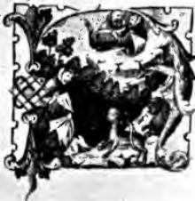
DANTE: "COMMEDIA". MANTUA, 1472. (From the copy in the John Rylands Library.)

si uolse in dritto arimmar il passo che non lascio gia mai per ona uia Poi chebbi ripolato il chorpo lasso ripresi uia per la piagia diserta si chel pie fermo sempreza il piu basso E echo quasi al chominciar dellerta una leonza legiera e presta molto che di pel machulato era chopena E nemisi partia dinanzi al uolto anzi inpediua tanto il mio chaminio chi fui per ritornare piu uolte uolto Tempo era del principio del matino el sol mentaua in su chon quelle stelle cheran chellui quando lamer diuino Messe di rima quelle chofe belle sicha bene sperar mtra chagione di quella sicra lagaieta pelle Lera del tempo ella doleie stagione ma non si che paura non midesse la uista che ma parue dun liene Questi para che chontro ame uenisse chella testa alta e chon rabiosa fame si che para chel aire netemelle E duna lupa che di tute brame sembiava charcha nella sua magrezza e molte giienti se gia uiuer grame Questa mi posse tanto digraueza chella paura chofe uia di sua uista chio perdei la speranza dellalteza E quale eguel che uolontieri acquista e giungie il tempo che perder lo facie ch'entrai i suoi pensier piangie e trista Tal mi fecie la bestia senza pacie che uenendomi ichontro apochi apochi mi ripingia la doue il sol tacie Mentre chio ruinaua imbasso locho dinanzi agliocchi mi si fu oferto che per lungo silenzio para fiocco Quando uidi ch'ostui nel gran diserto miserere dime gridai allui qual chi tu sia o ombra o homo cierto