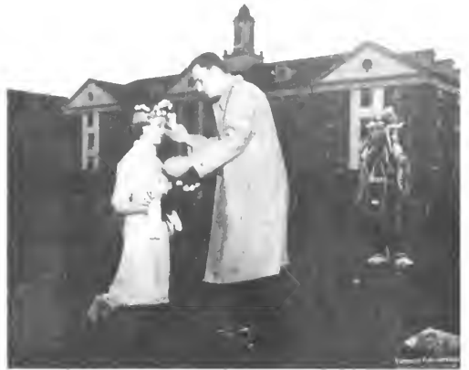
Crowning of Homecoming Queen