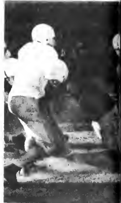
The "Warrior" backfield works