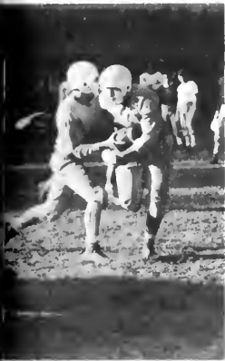
Photograph taken during Pre-season football game