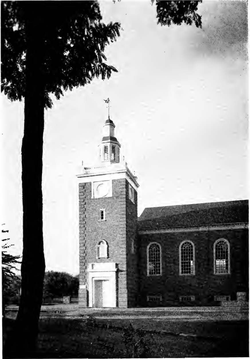
Martha B. Clarke Memorial Chapel and Dining Hall