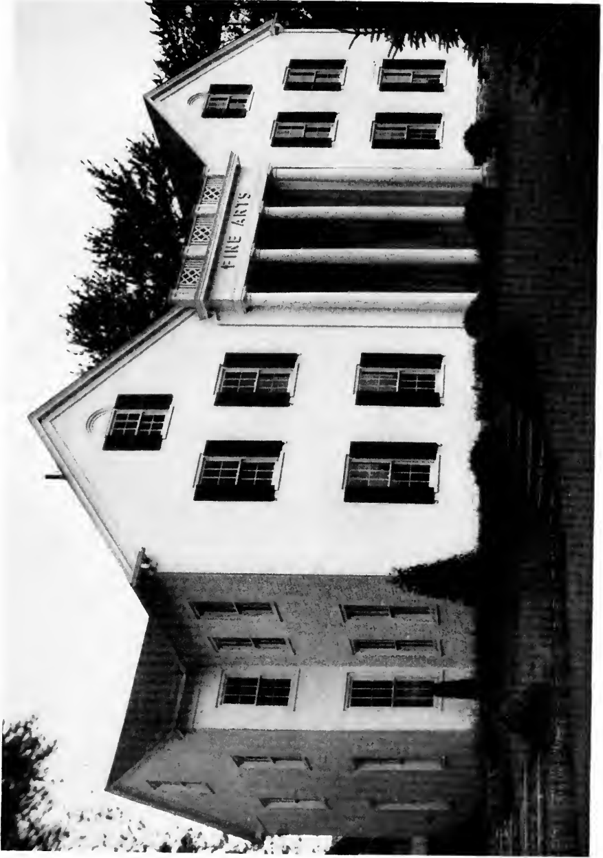
Fine Arts Building