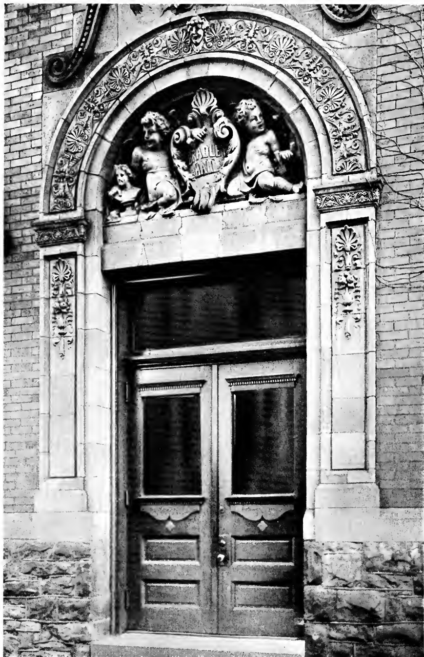
Bradley Hall Entrance Edward James Gray Memorial Library Dramatics