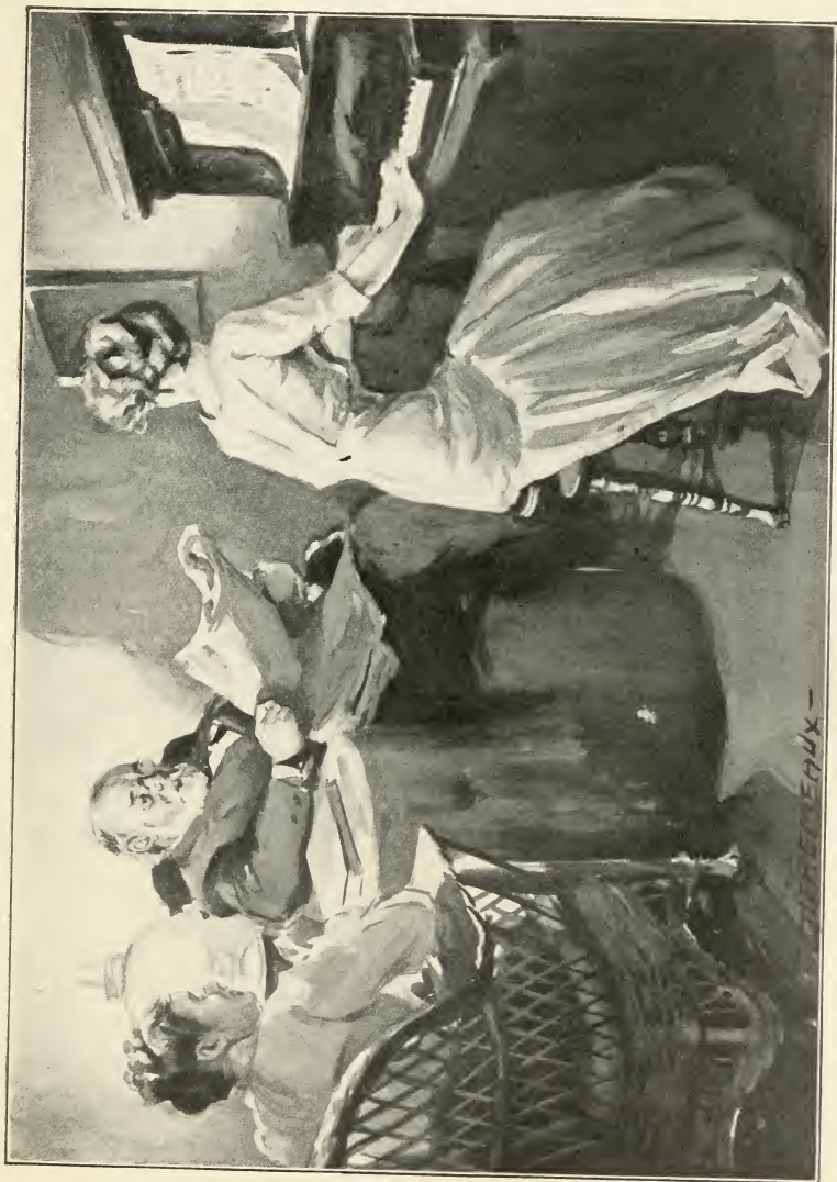
"IVY, I DON'T LIKE THAT BALL PLAYER COMING HERE TO SEE YOU"