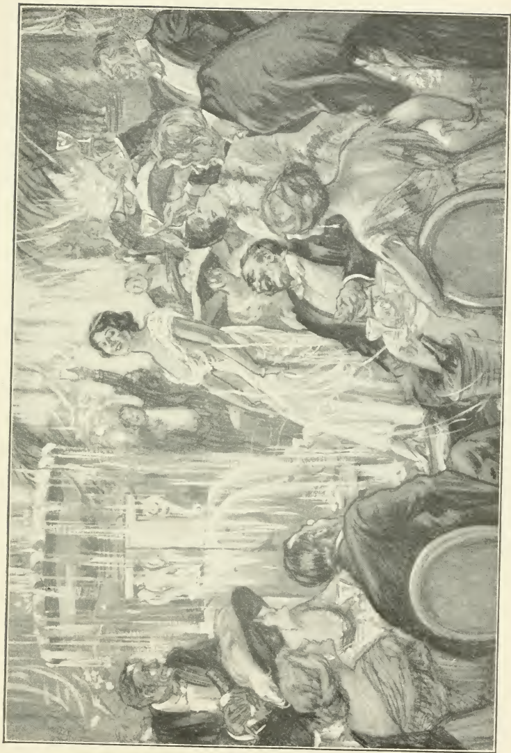
“SLOWLY AND GRACEFULLY HAD WADED INTO ITS CHILLING MIDST”