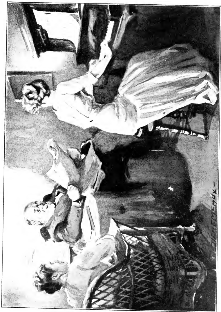
"IVY, I DON'T LIKE THAT BALL PLAYER COMING HERE TO SEE YOU"