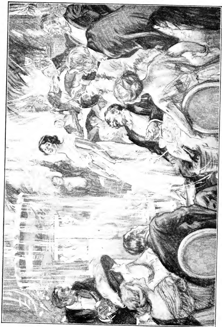
"SLOWLY AND GRACEFULLY HAD WADED INTO ITS CHILLING MIDST"