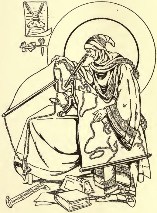
Christmas and the Literature of Disillusion