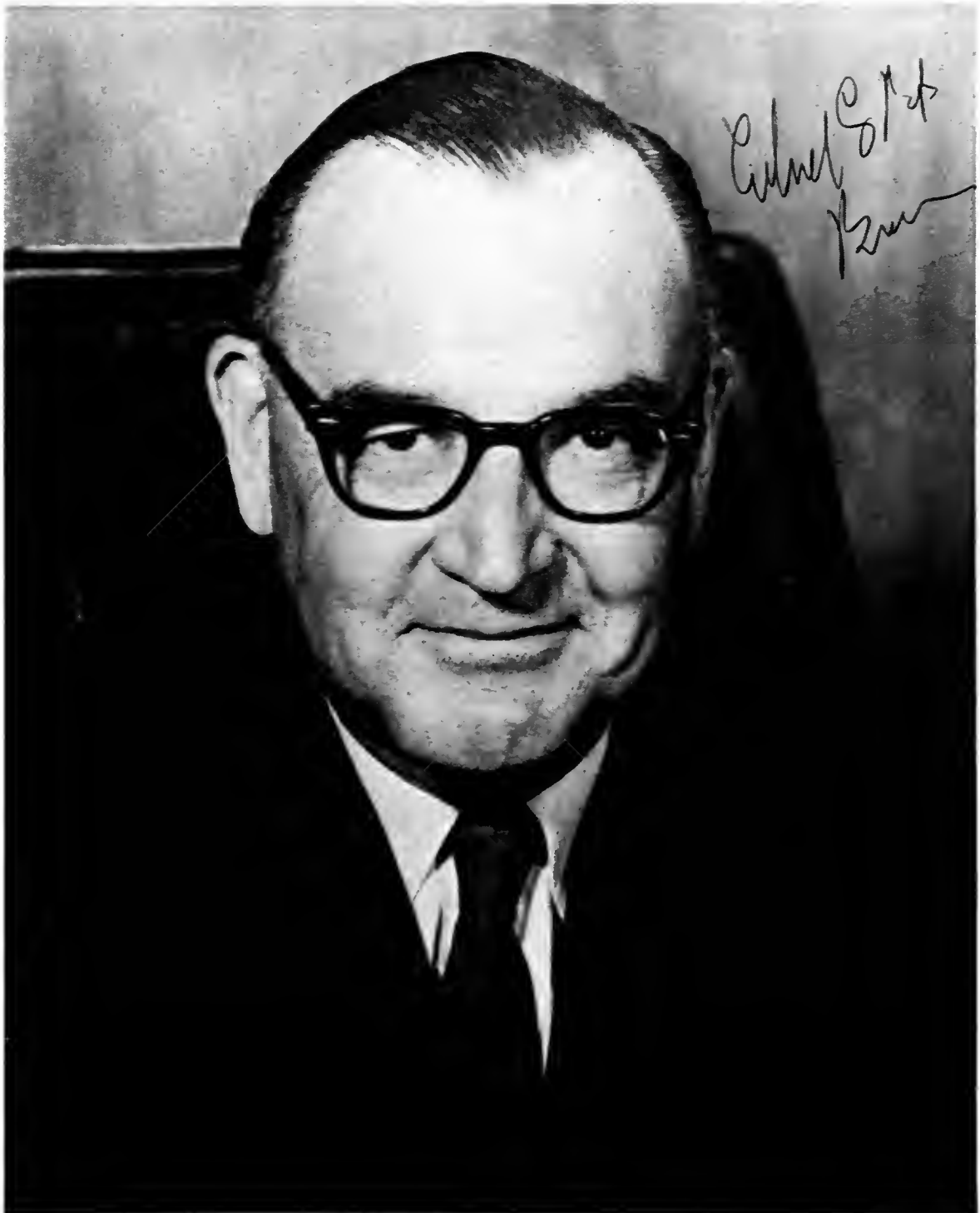
EDMUND G. BROWN, SR.