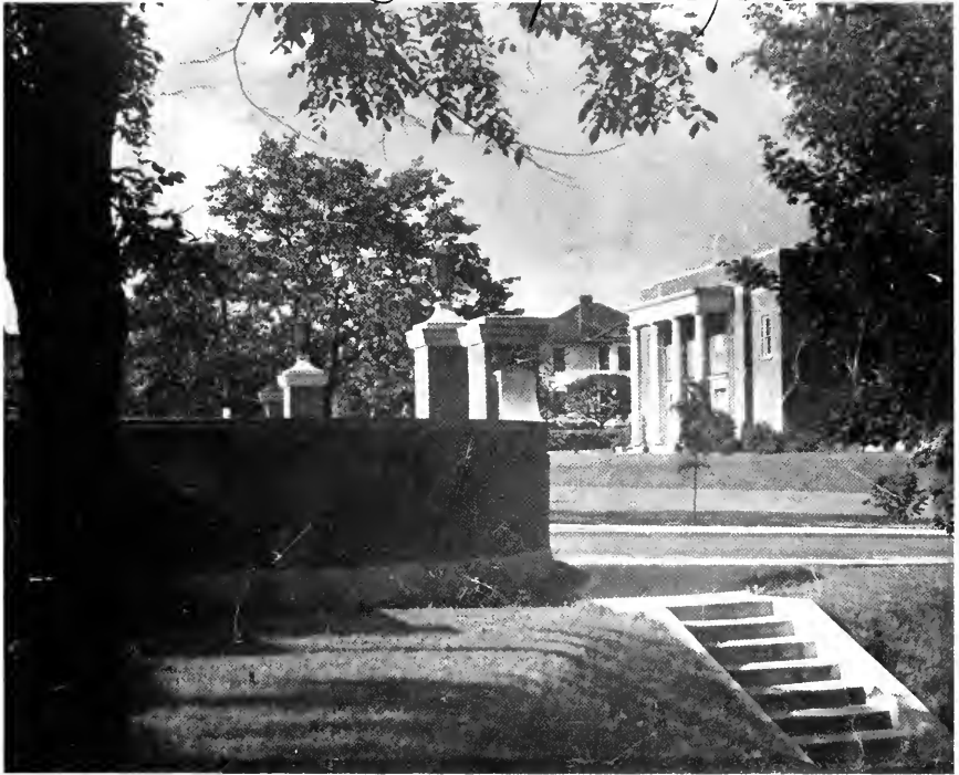
ENTRANCE TO B. N. DUKE AUDITORIUM