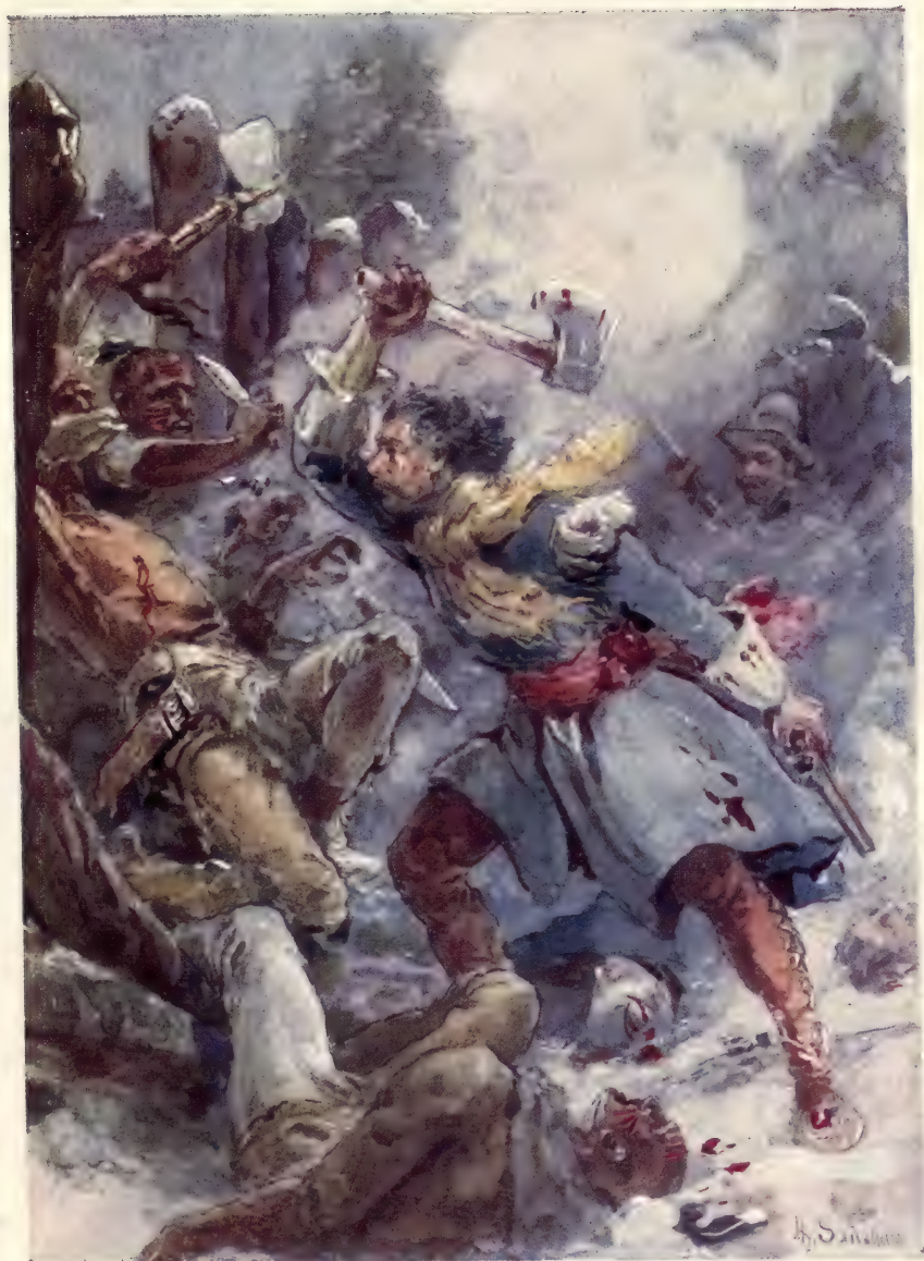
Dollard strikes his Last Blow, 1658