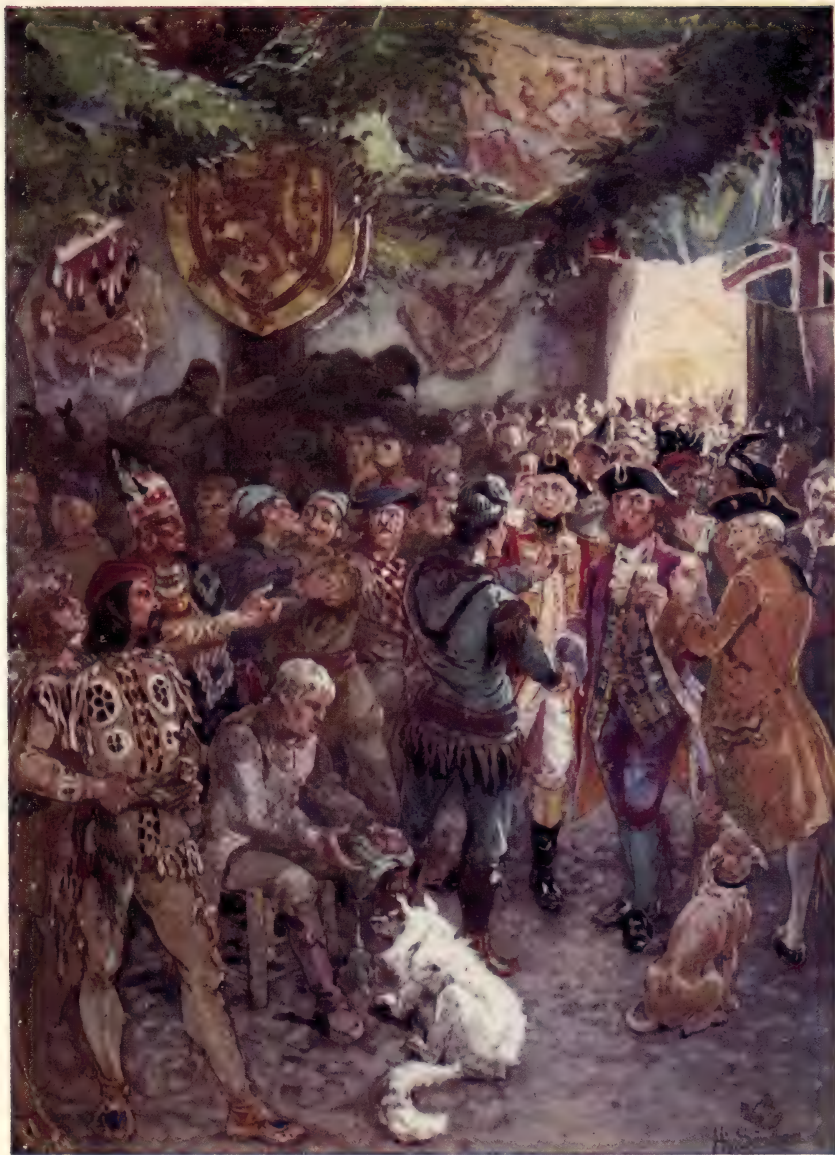
Meeting of the Nor'-Westers at Fort William, 1816