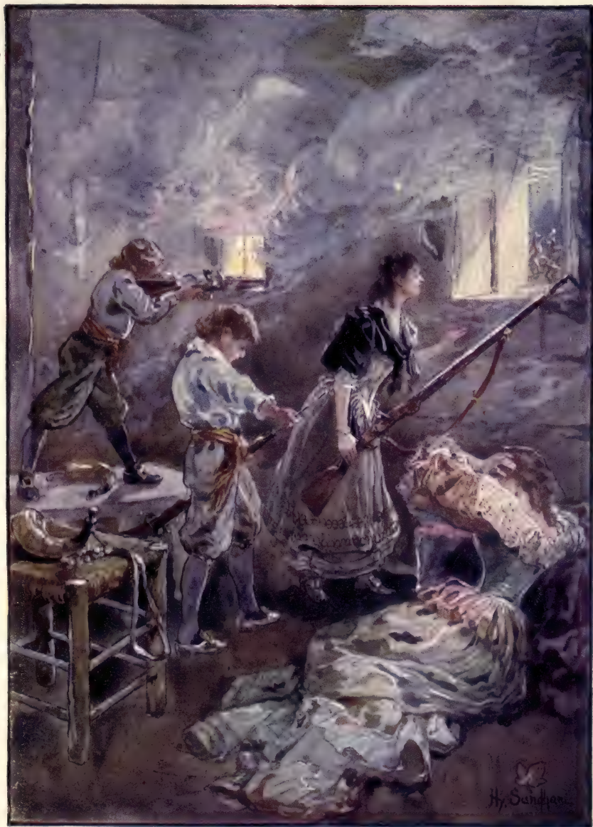
Heroic Defence by Madeleine de Verchères and her Brothers, 1692