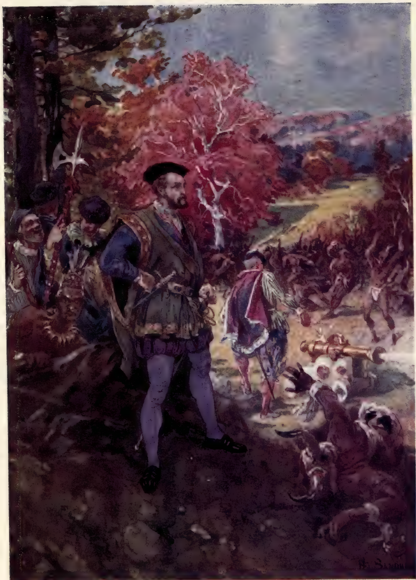
Jacques Cartier and the Red-skins