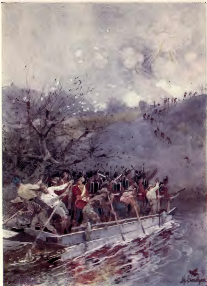
The Defeat of Louis Riel, Fish Creek, 1885