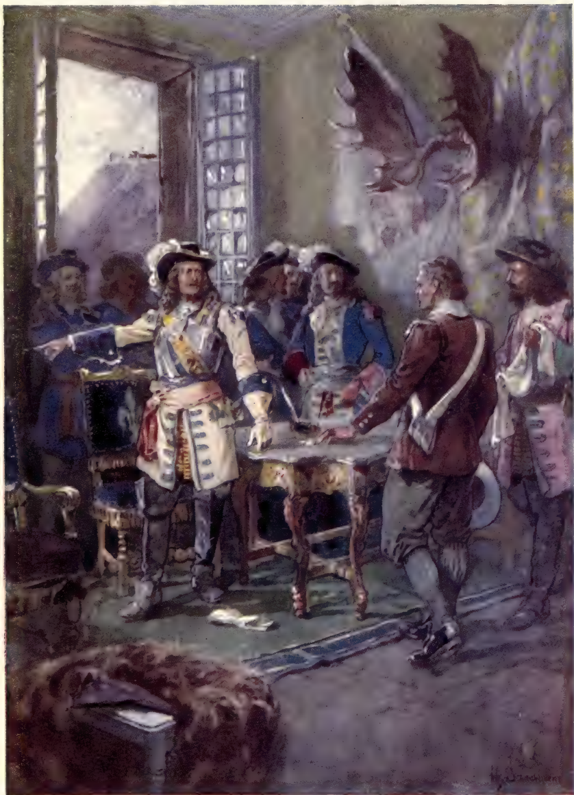
'My Guns will give my Answer,' Frontenac, 1690