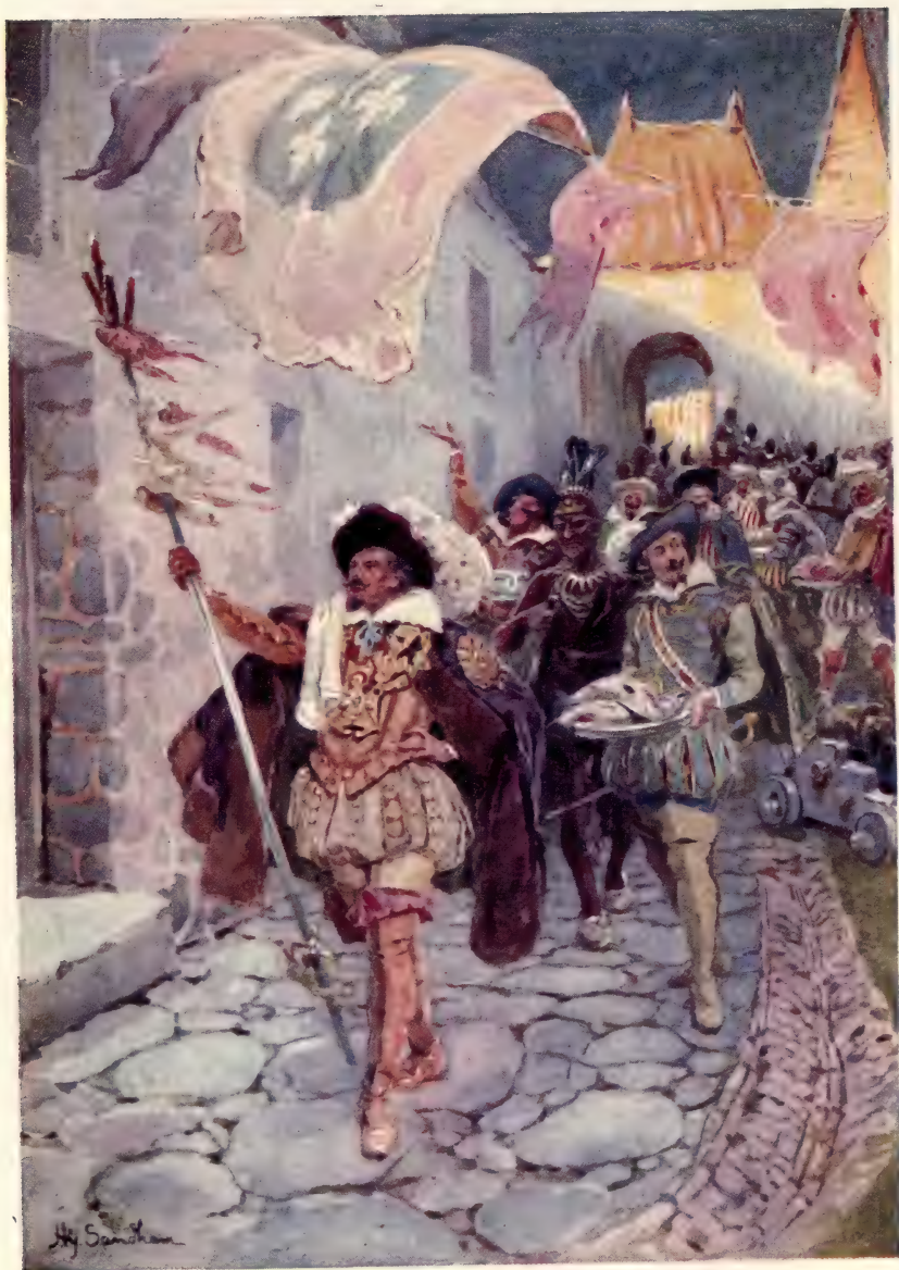
'The Order of a Good Time.' 1606