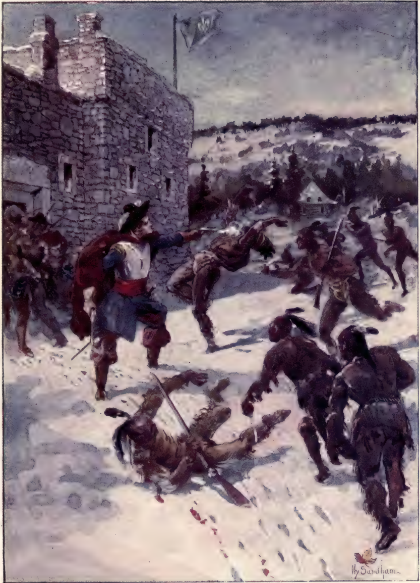
Maisonneuve covering the Retreat of his Followers, 1644