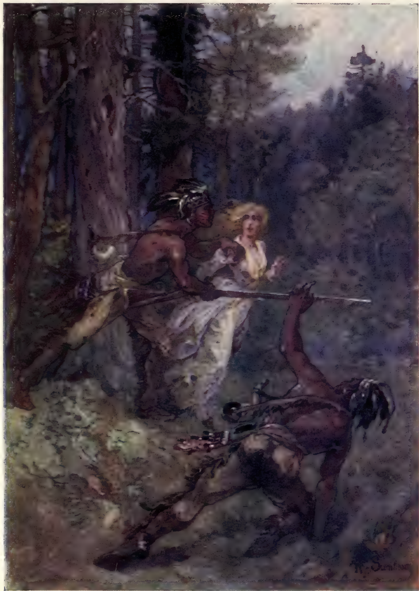
Laura Secord intercepted by the Mohawk Scouts