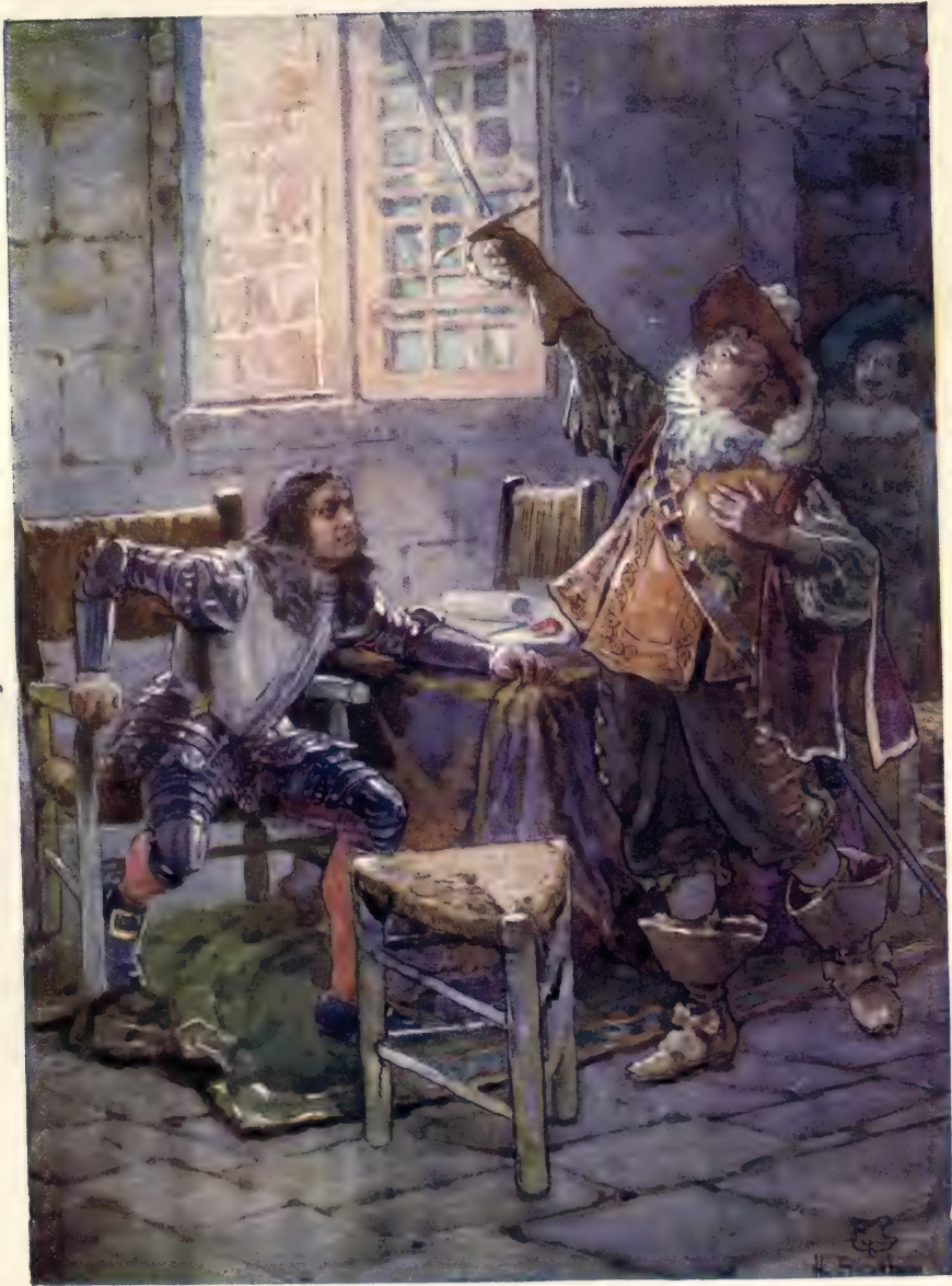
De la Tour refuses to yield his Allegiance, 1630