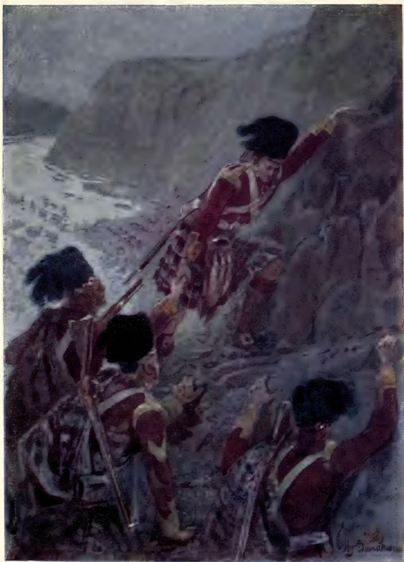
Wolfe's Army scaling the Cliff at Quebec, 1759