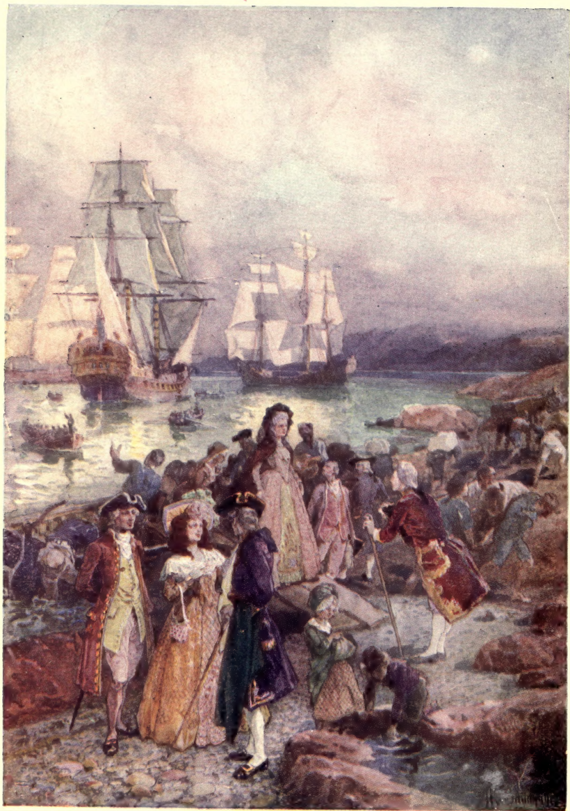
Landing of the Loyalists, 1783