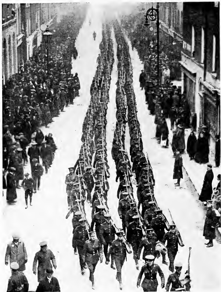
THE IRISH CANADIANS MARCHING THROUGH LIMERICK.