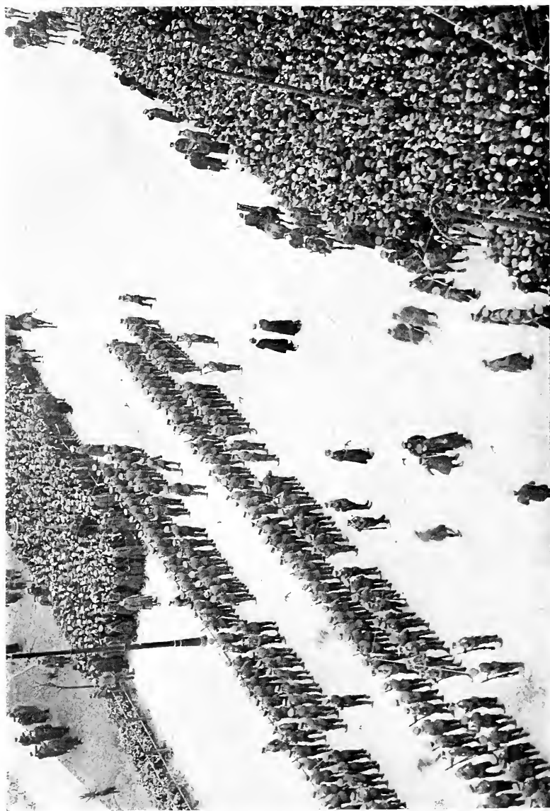
FORMED UP IN FRONT OF THE CITY HALL.