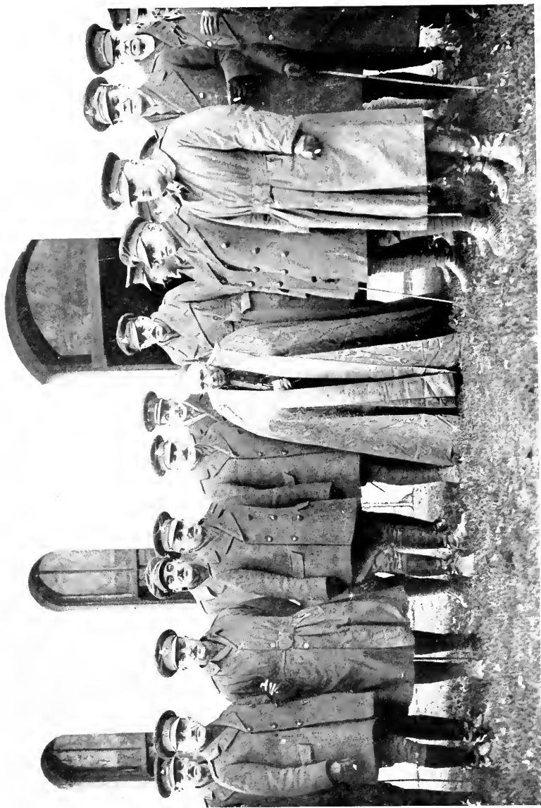
HIS EMINENCE CARDINAL LOGUE, WITH OFFICERS OF THE IRISH CANADIANS.