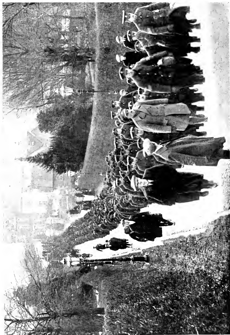
THE MARCH TO THE CATHOLIC CATHEDRAL AT ARMAGH.